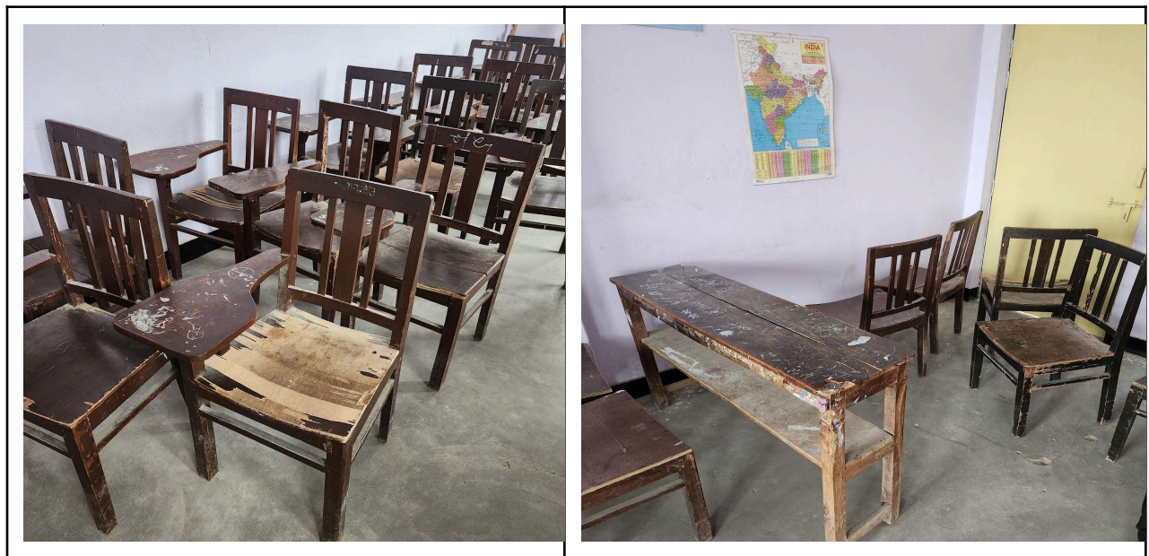
Old chairs and benches in some classrooms that need replacement