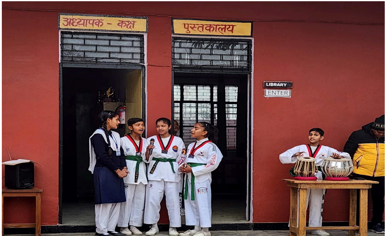
Song and tabla performance by kids, some of whom are also learning Taekwondo