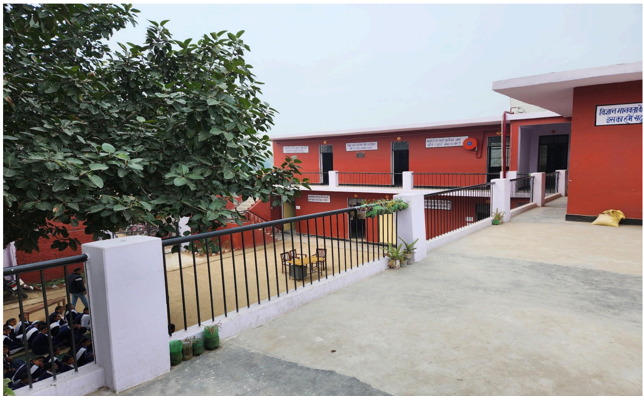
View from school terrace