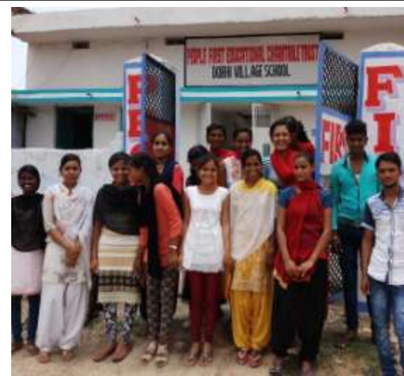
This year students have passed the secondary exam from our Dobhi School