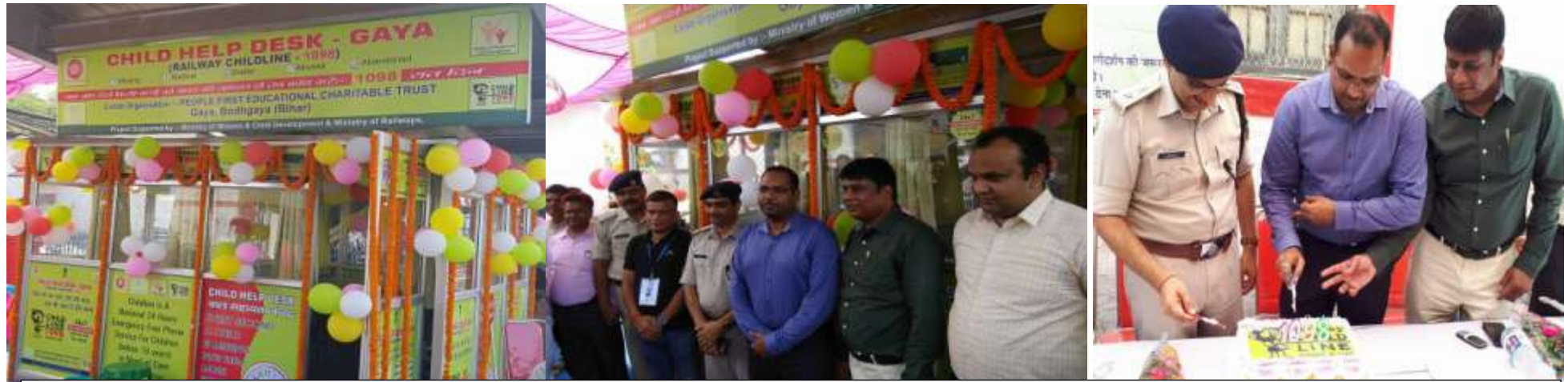
Childhelp desk was officially opening by the District Magistrate and Senior Superintendent of Police Gaya on 29 th September 2018

People First has recently been rewarded to operate another Child Help Desk at Gaya Railway platform by joint initiative of Indian Railway and Child and Women Development Ministry Govt. Of India