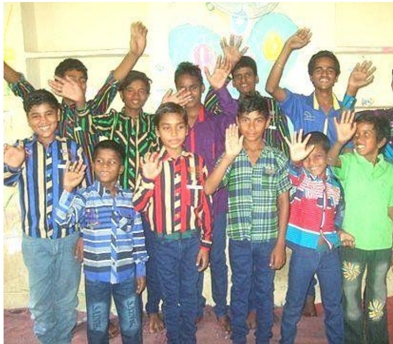
Some of the many rescued boys at Koderma Rescue Junction