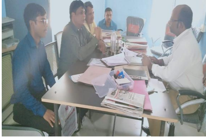
Meeting with Child Welfare Committee Koderma