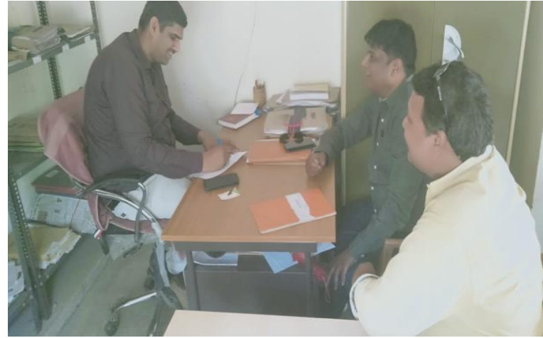
Meeting with Child Protection Officer Koderma