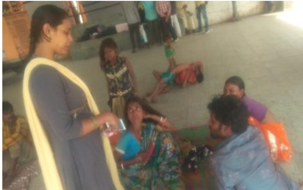
Staff visiting and contacting with parents at Railway platform Koderma