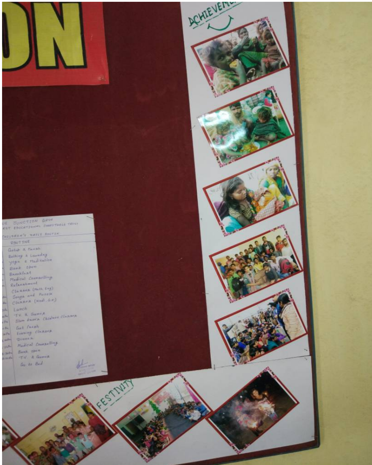
Pictures showcasing achievements and festivity pictures at the Rescue Junction