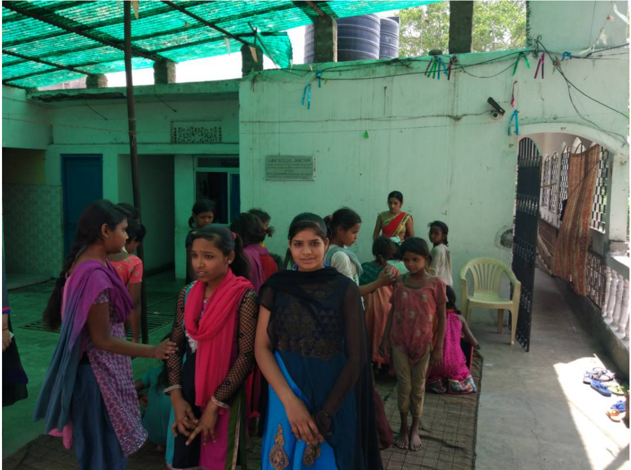
Some of many girls rescued by the Rescue Junction, Bodh Gaya. At the back, one of the female care-takers can be seen