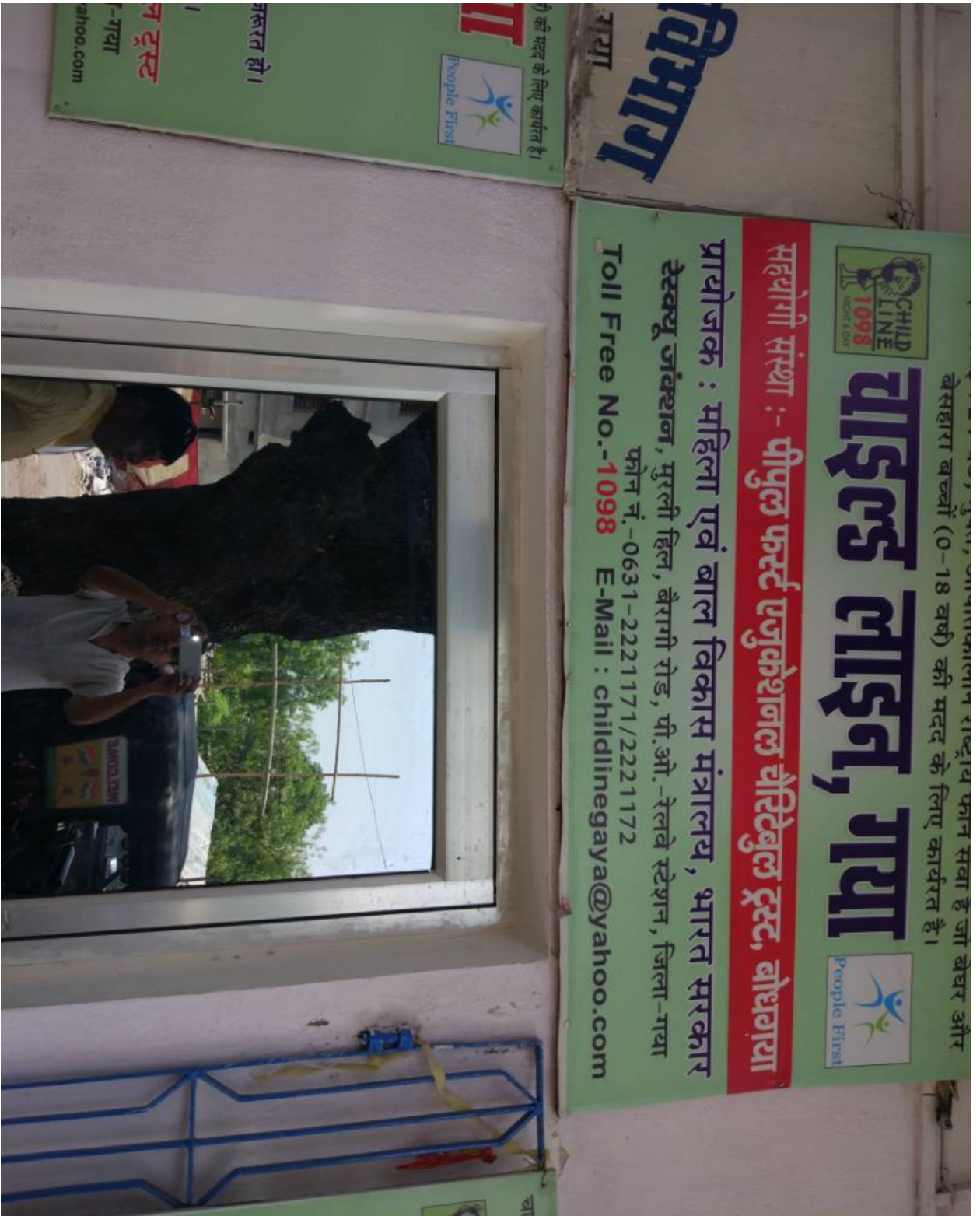
Main entrance of Rescue Junction at Bodh Gaya