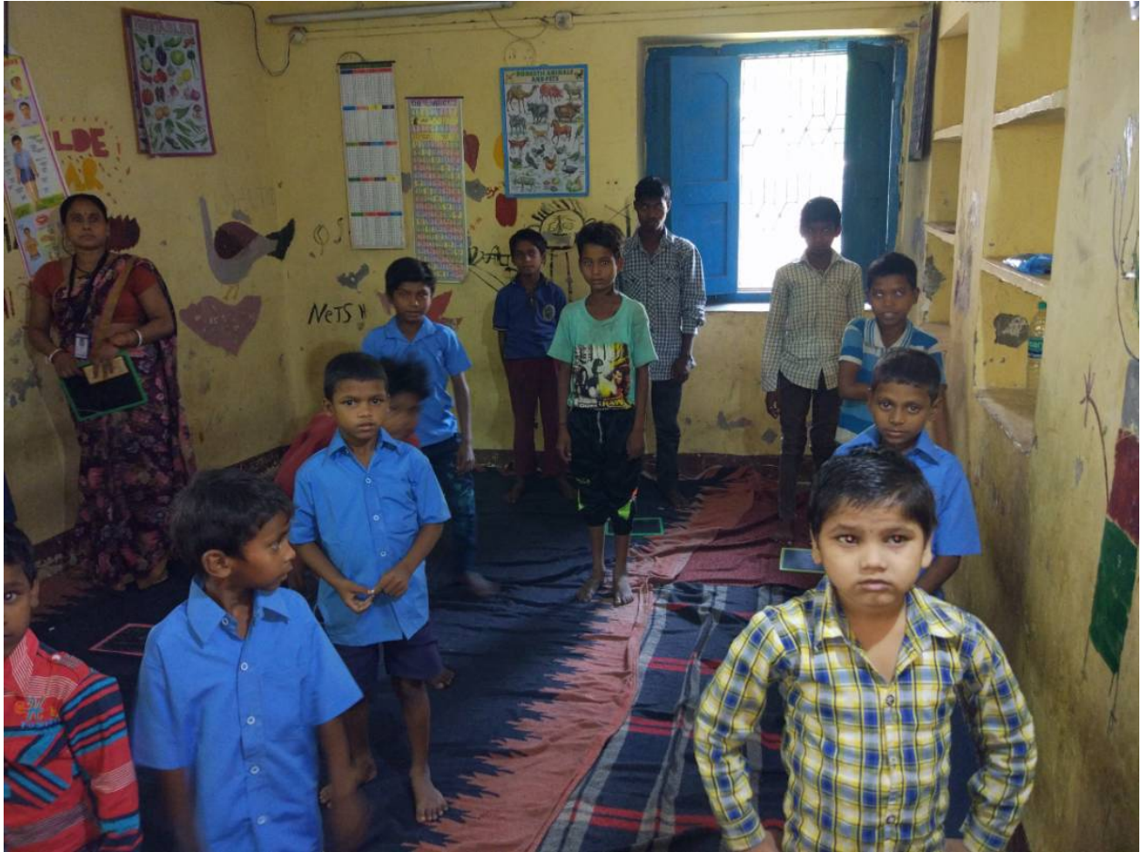
Some of many young boys rescued by the Rescue Junction, Bodh Gaya. Again, a care-taker can be seen standing on the left hand side