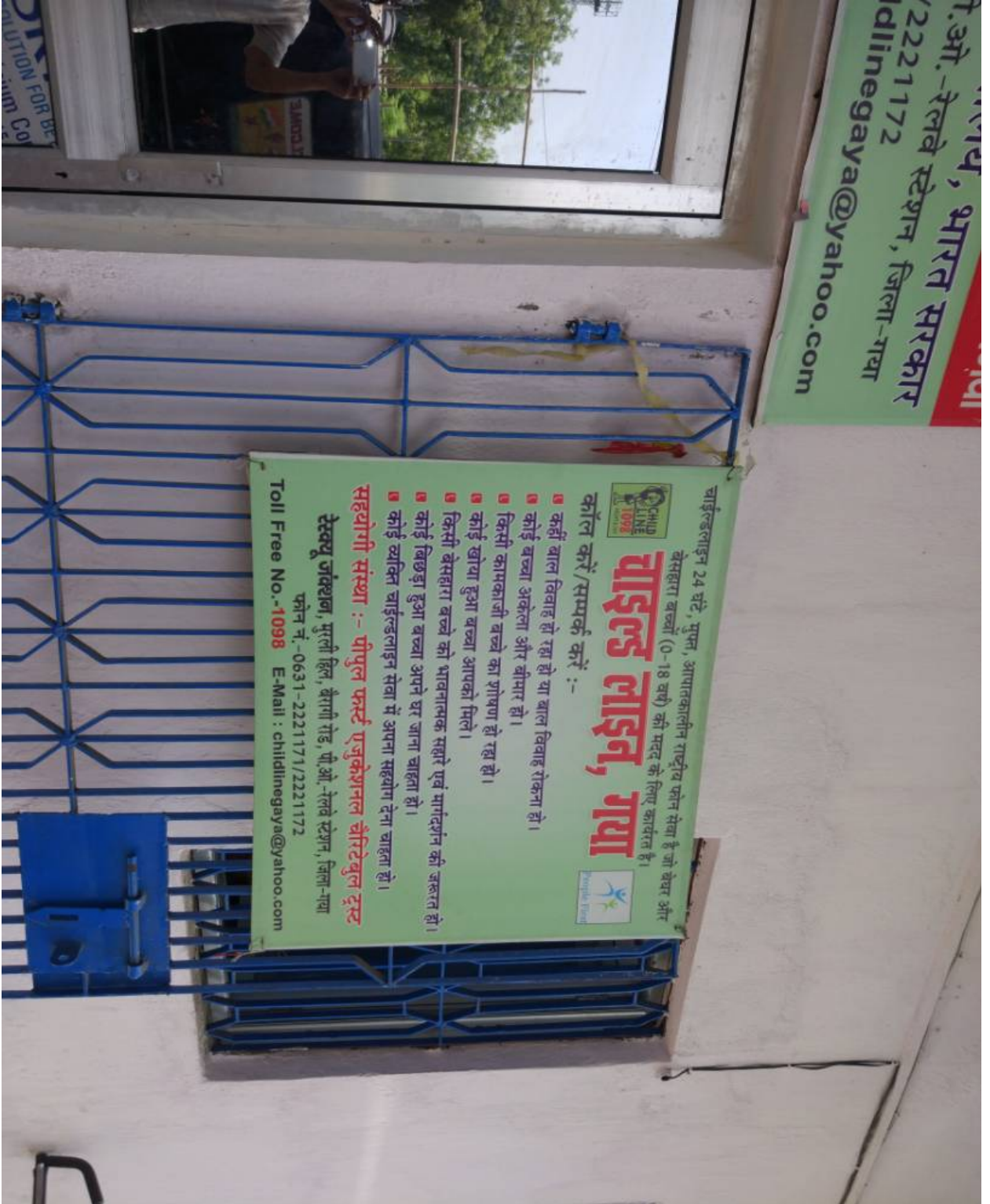
Notice board informing public to contact Rescue Junction Childline if anyone observes an underprivileged child in need