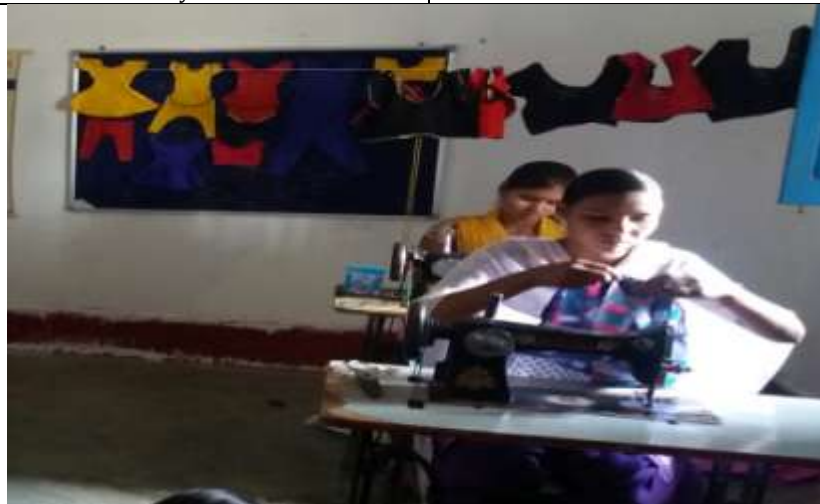
Women are receiving training in the village sewing centre