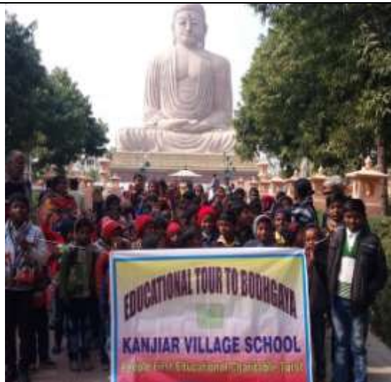
Children visited Bodhgaya from Kanjiar Village School