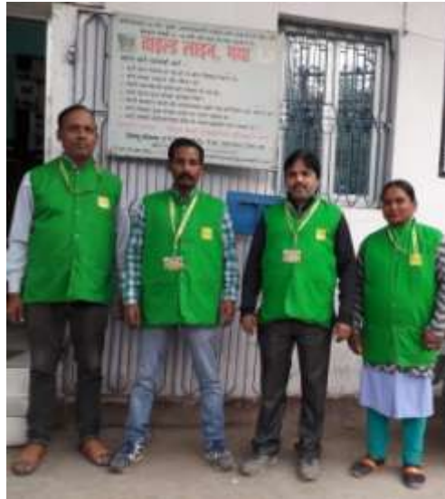
Our Child help line team