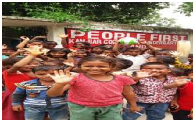
Children at Kanjiar Village