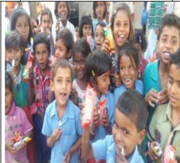
Children are enjoying at their school in the village