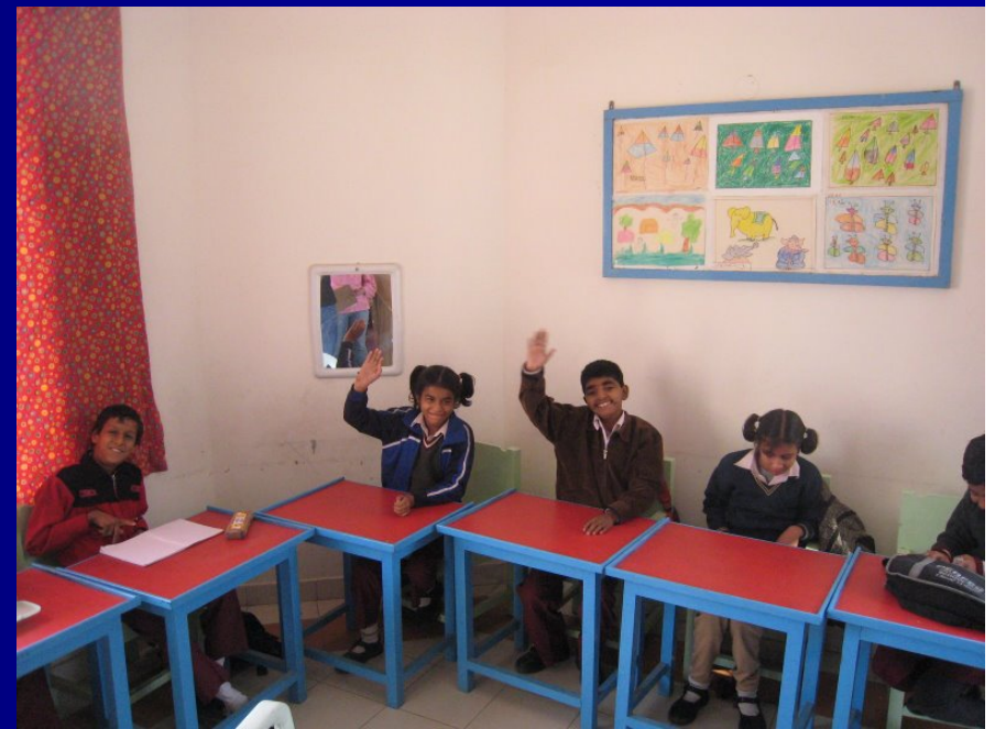
Academic – I class session in progress