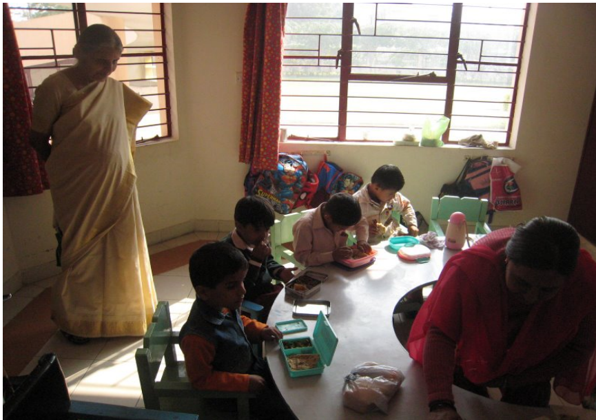
Pre-academic class session in progress