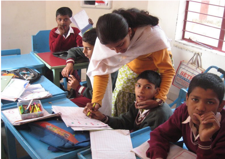
Academic-II class session in progress