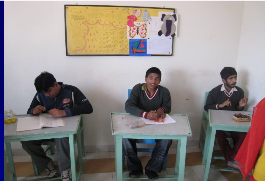
Stimulation senior class in progress