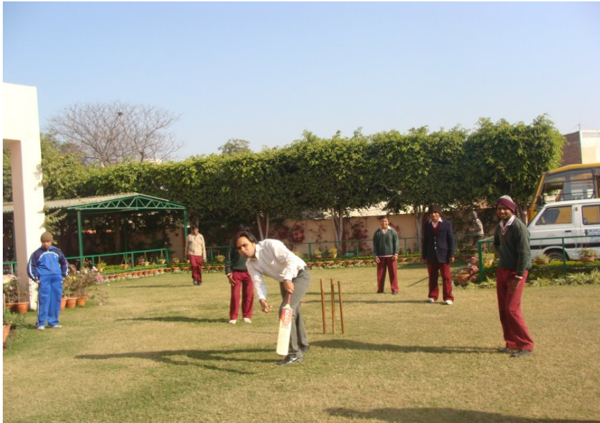
Sports - Cricket