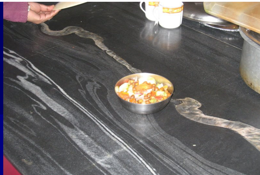
Chat for the day