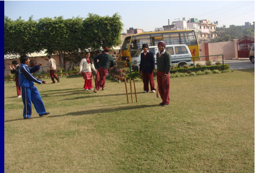
Sports - Cricket