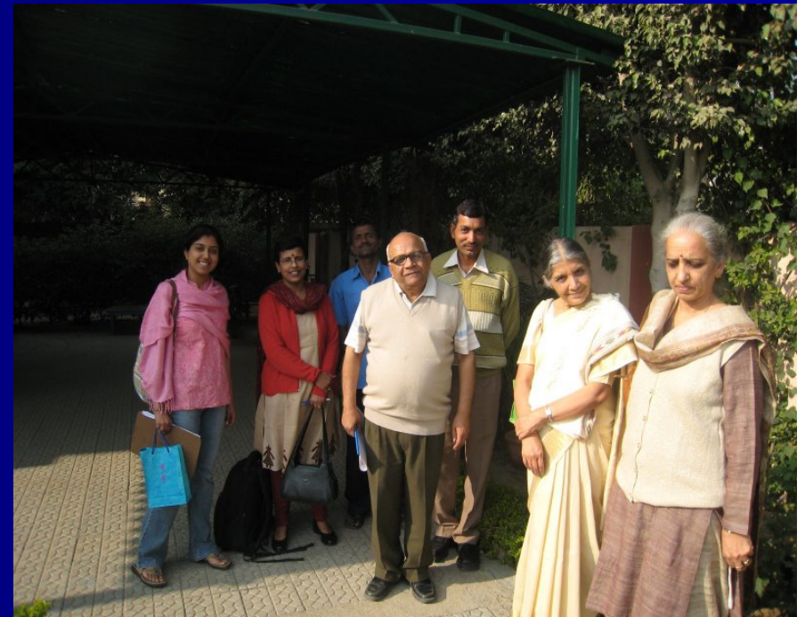
End of the site visit