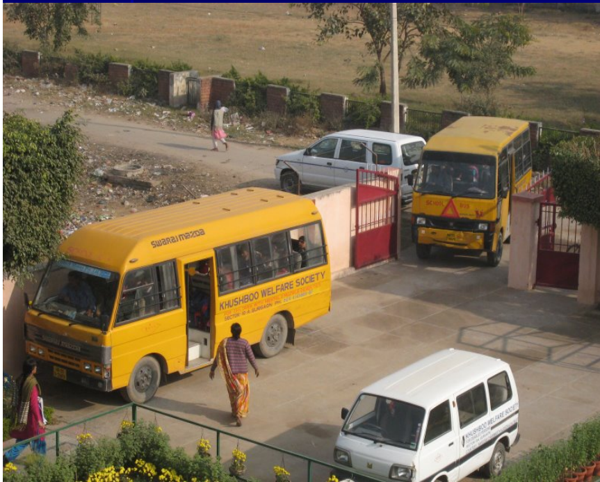
End of the day