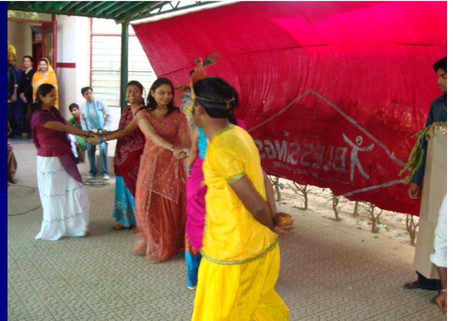
A skit for the children