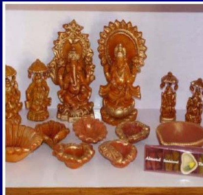
Diwali - diyas & items