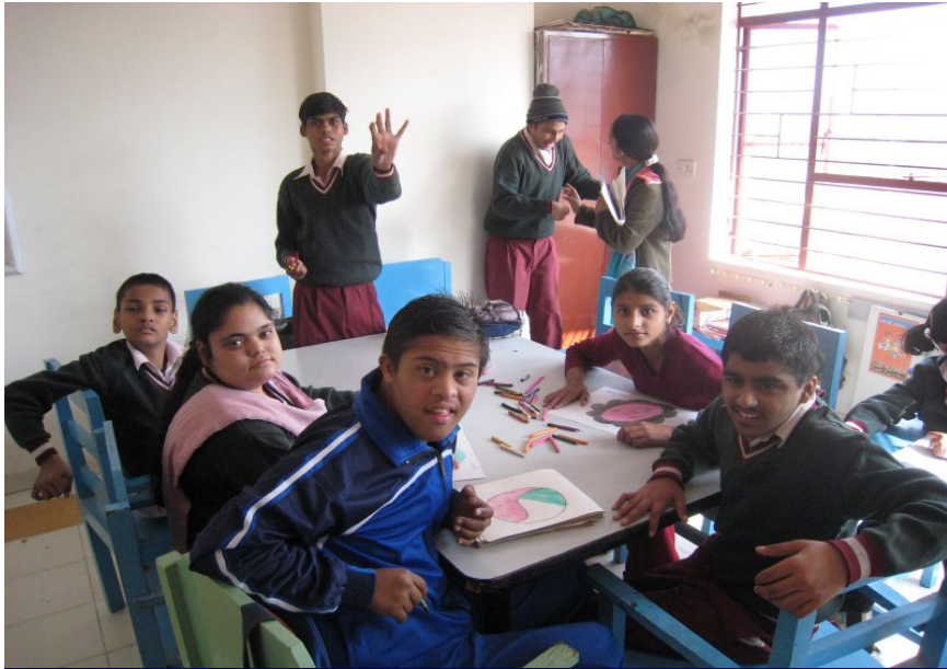
Pre-vocational junior class in progress