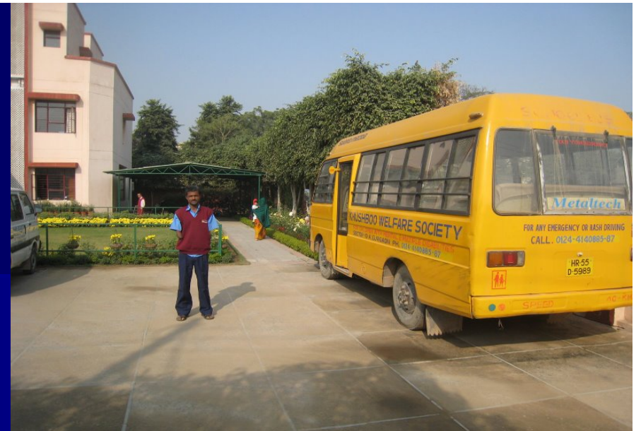
Sehdev, caretaker; and one of the school buses