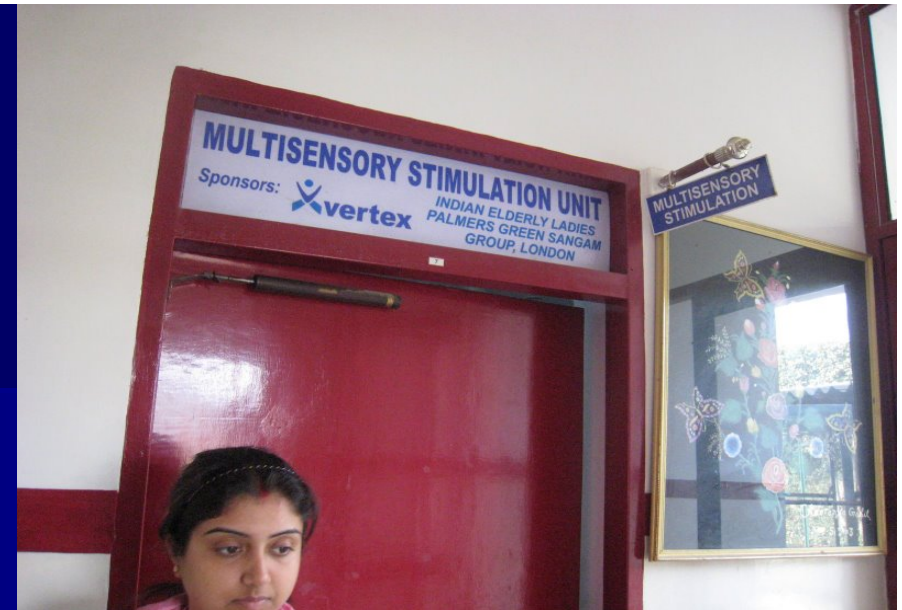
Multi-sensory stimulation unit (MSSU)