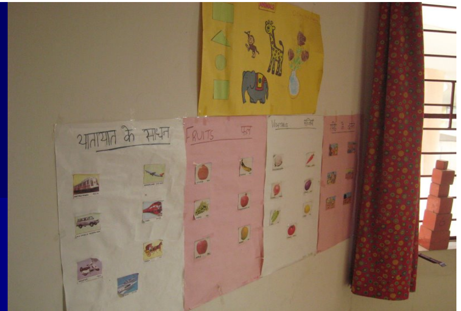
Charts in the Pre-academic class