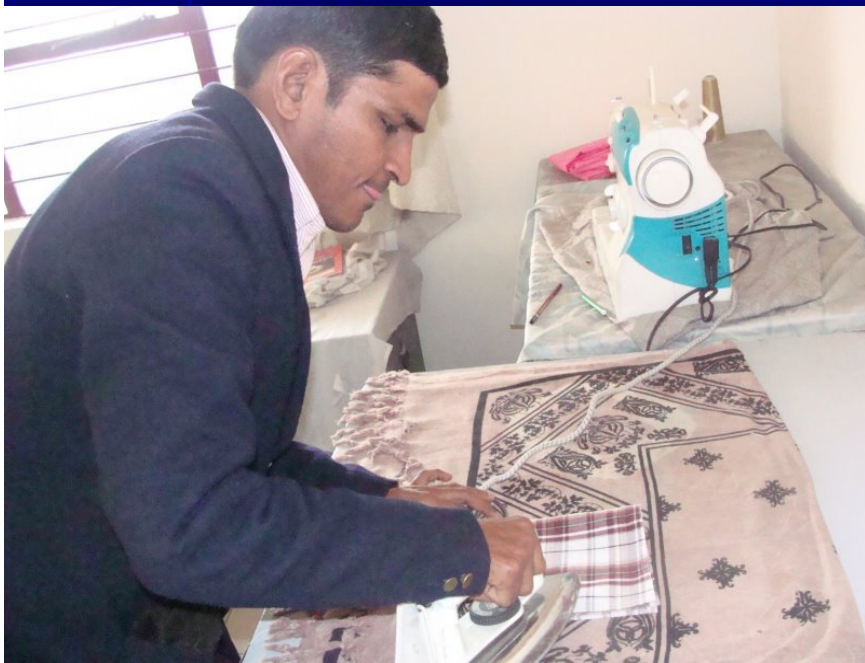
Tailoring - Ironing