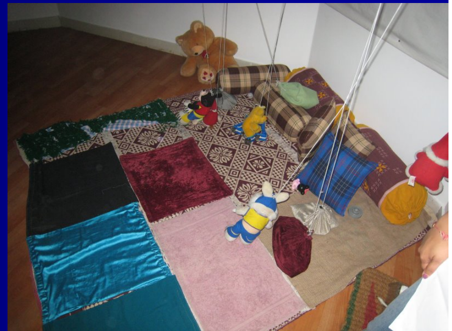
Touch therapy at MSSU