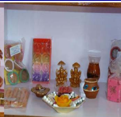
Diwali - wax items