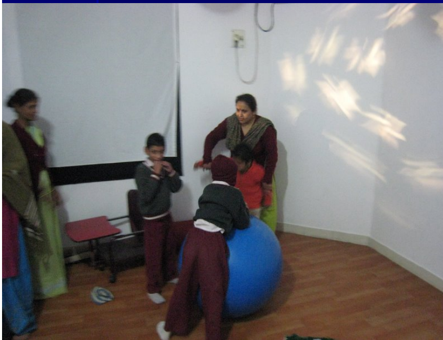
A session at MSSU in progress