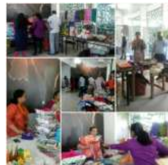
Stall at Schneider, Bangalore