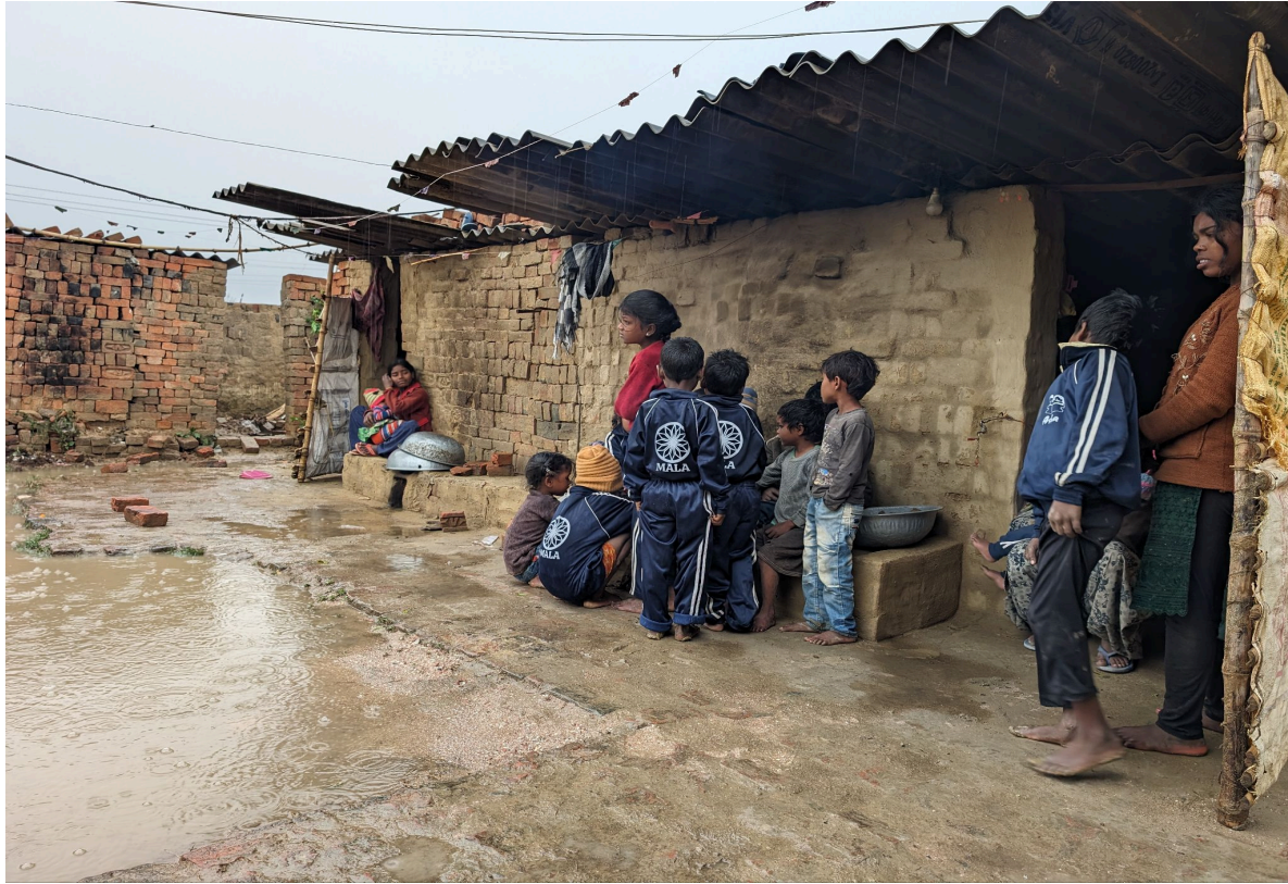
Pic 3 - We tracked down the students to their houses and I got to interact with a few

The second center I visited was a newly started library at Dhanapur village. The local primary health care center of the village offered a spare room in their building to house the library. The health care center is a bit further away, on the fringes of the village which made it a bit hard for students to get there. After a few months, they were asked to relocate and a new space was found in Dhanapur village, closer to the community making it easier for students to get to the library. The new premises had to be rented while the earlier space was free. However, this new space has the potential for expansion and I can see the space filling up with books and students as the library center grows. The current book collection and student enrollment is quite small to yet see a meaningful impact. For the 2024-25 budget, Dhanapur library operating expenses are being considered and this location will be monitored in the next year to ensure its growth and success.