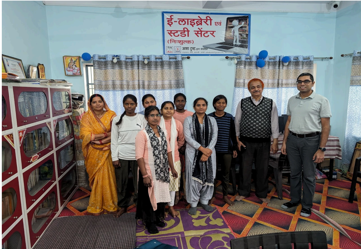
Pic 4 - The Kaithi e-library and study center