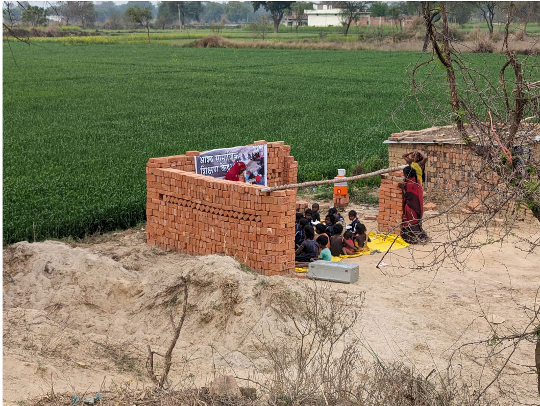
Pic 6 - Study center at Rudra Brick field - a brick kiln in Kaithi area