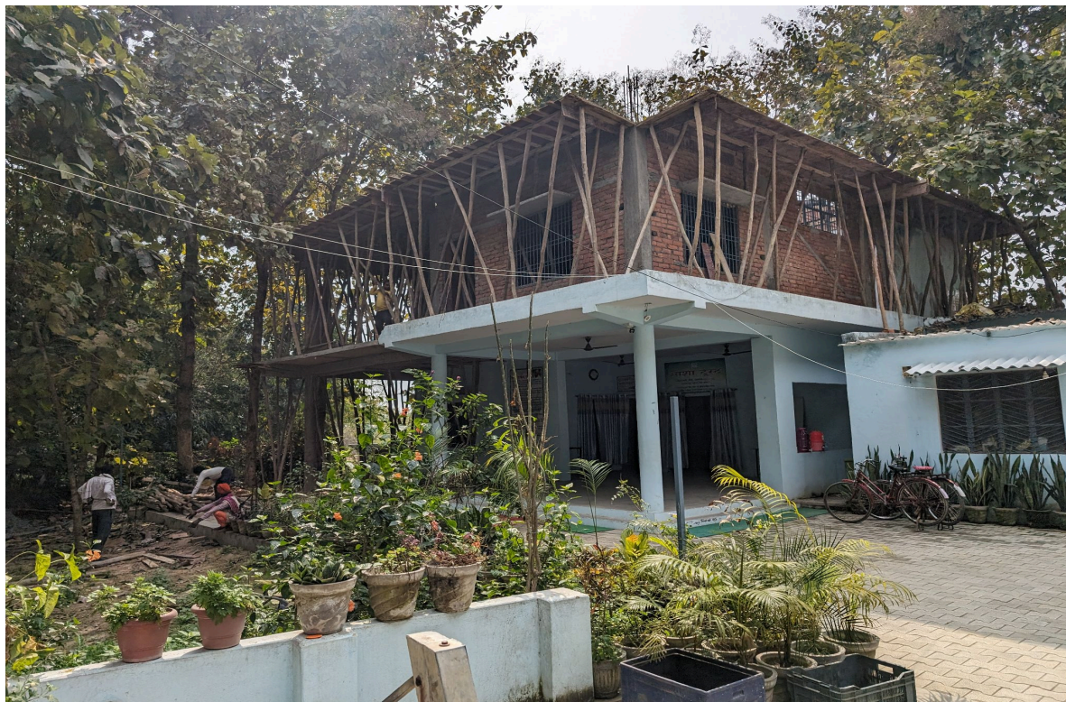
Pic 5 - Adding a new floor with a few more rooms at the Kaithi center