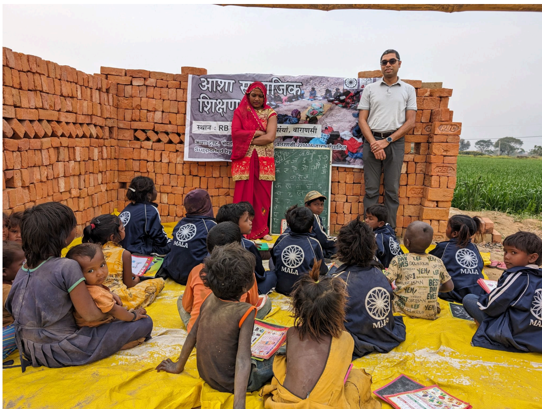
Pic 7 - Brick kiln study center - Rudra Brick fields