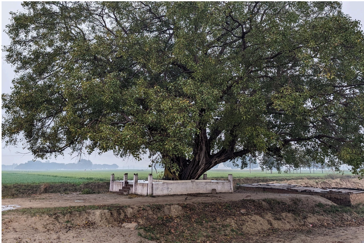
Pic 2 - That's where classes for Paniyara center happen. Classes had to be called off due to rain

I visited the Paniyara center, which operates on a brick kiln. Since it rained on the day of my visit, the students were sent back home early and we ended up going over to their quarters. I interacted with some of the students who had just started learning at the center about 4 months ago. These children were of different age groups, most had never been to a school before and were barely learning to read and write.