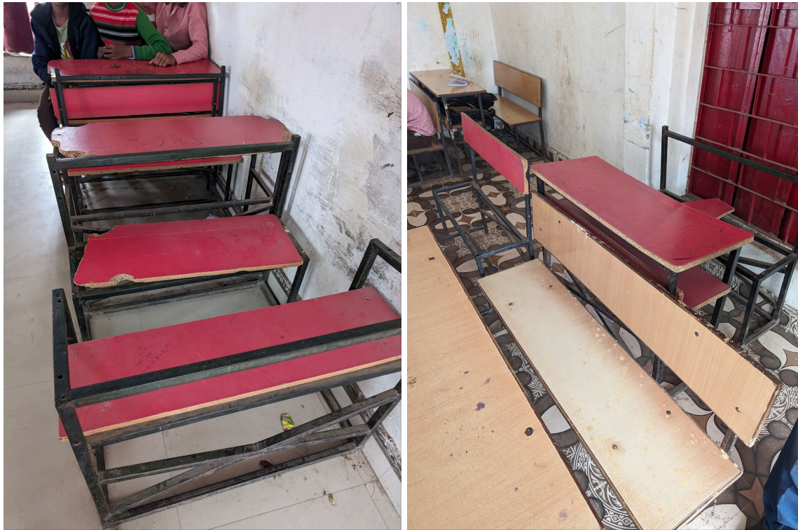
Pic 8 & 9 - unusable furniture at Govt school Dudawan, Kaithi, Varanasi District

I got to visit one govt school in Dudawan and saw some Asha supplied material in use. The infrastructure at this particular govt school wasn't in good shape with classes having broken furniture and/or broken windows. While I've witnessed worse, this school at least had most of their staff in attendance and roughly 75% of the enrolled students attending on a regular basis.