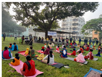
SSN admission test