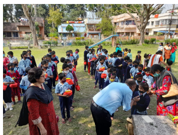
Lunch packet distribution