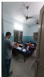
Classmate Educator Program Coaching Classes

On 30th May evening, I visited Kalyania again. This time, I visited the evening coaching classes, and met some Kalyania representatives in their main office to go over the attendance register and related documents. I also found classes for visual and performing art classes were on in full swing with large number of boys and girls students undergoing training is drawing, dance, recitation, singing etc.