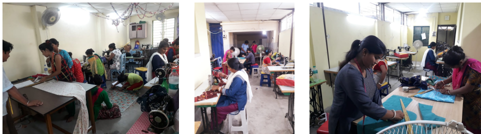
Kalyania Sewing Training Center