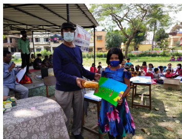
Sit and Draw competition at Kalyania