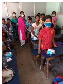
Lunch on a holiday