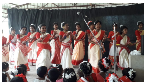
SSN students performing