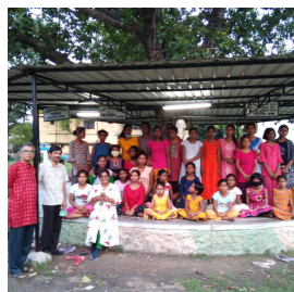
With the students of performing arts