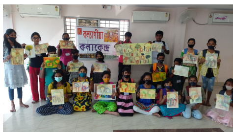
Brush spray painting Workshop