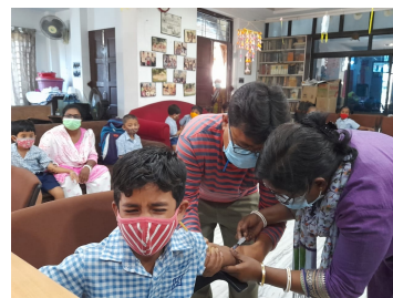
Blood group determination