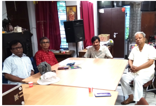
Meeting with representative of Kalyania GB