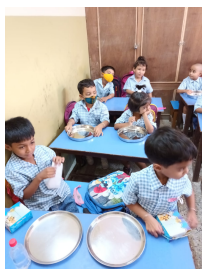
Waiting for lunch