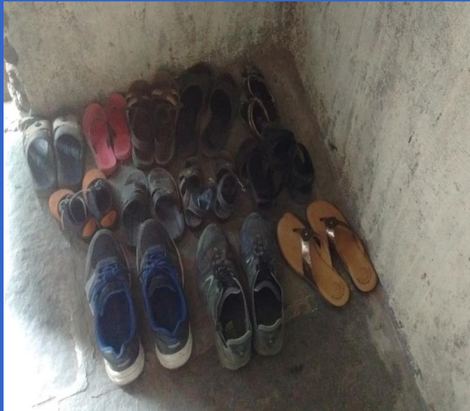
Example of discipline followed