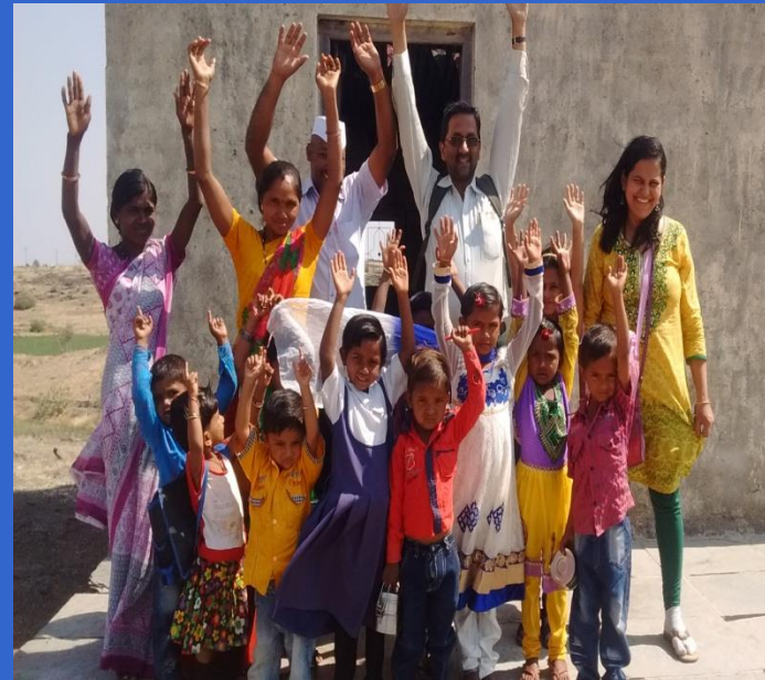
Big Cheers at send-off 😊 😊