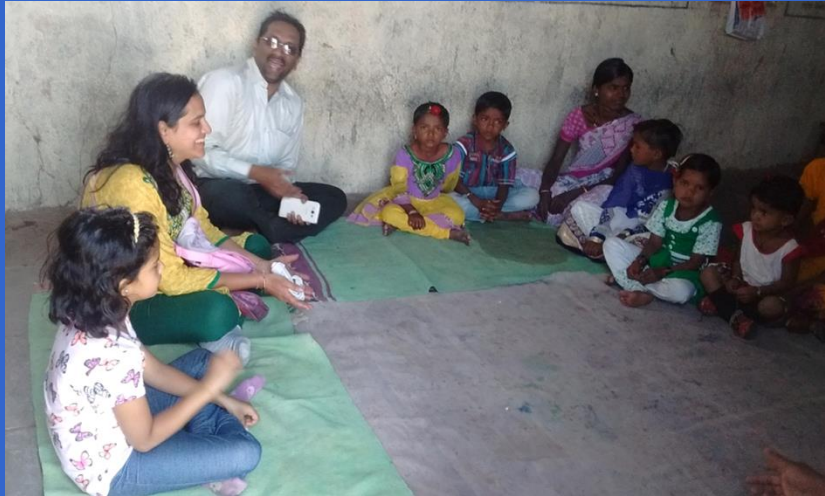
Few light moments with students