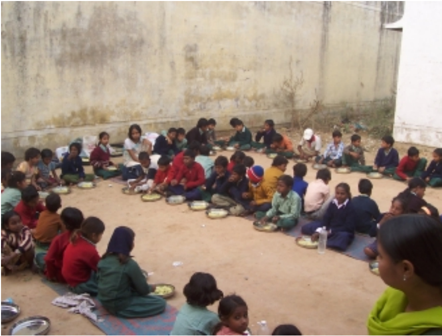
Fig. 6: Dhamikheda, Awas Bikas, Kanpur.