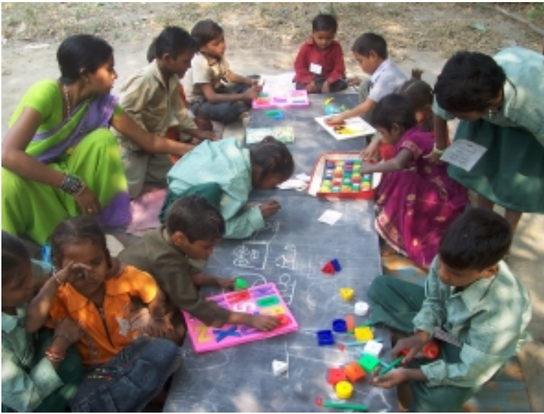
Fig. 4: Panki centre, Kanpur.