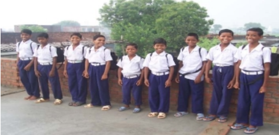
Ek Kadam Students

Twelve former students of different Apna Skool centres are now part of a residential educational project for migrant workers' children Ek Kadam currently situated in Nankaari , Kanpur. All the students are studying at Swami Vivekananda Vidyalaya, Lodhar, and Kanpur.