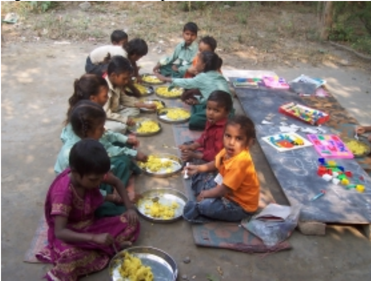
Fig.5: Panki Centre, Kanpur.