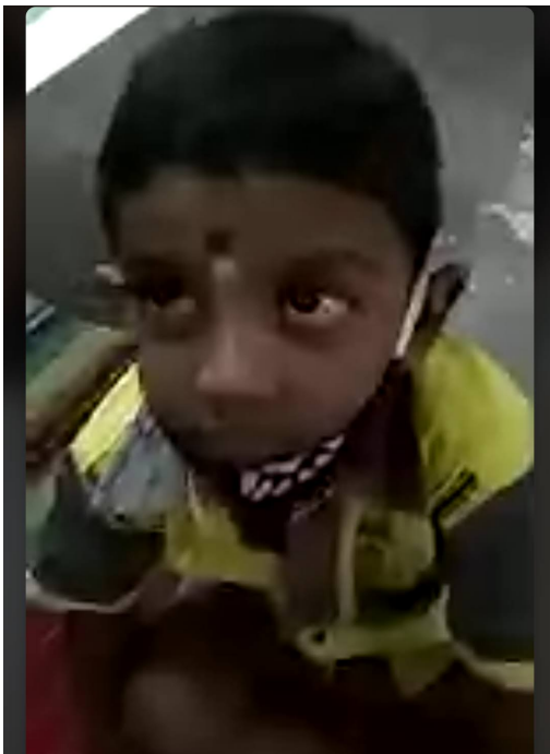
3. Pre-primary student interacting during the call