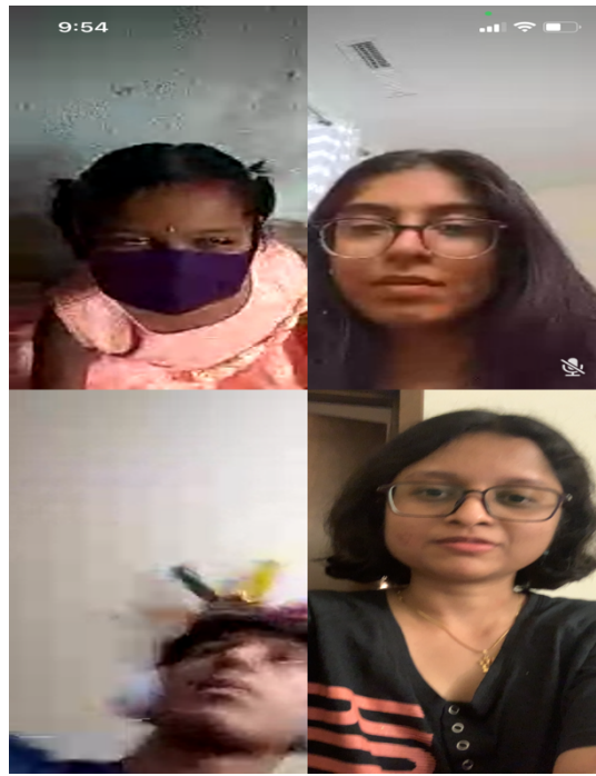
6. Pre-primary kid interacting with ASHA, UIUC