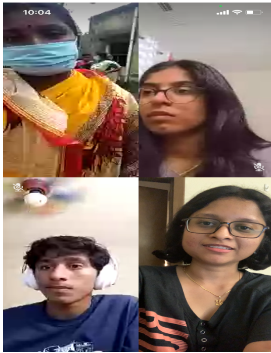
5. Parent interacting with ASHA, UIUC members