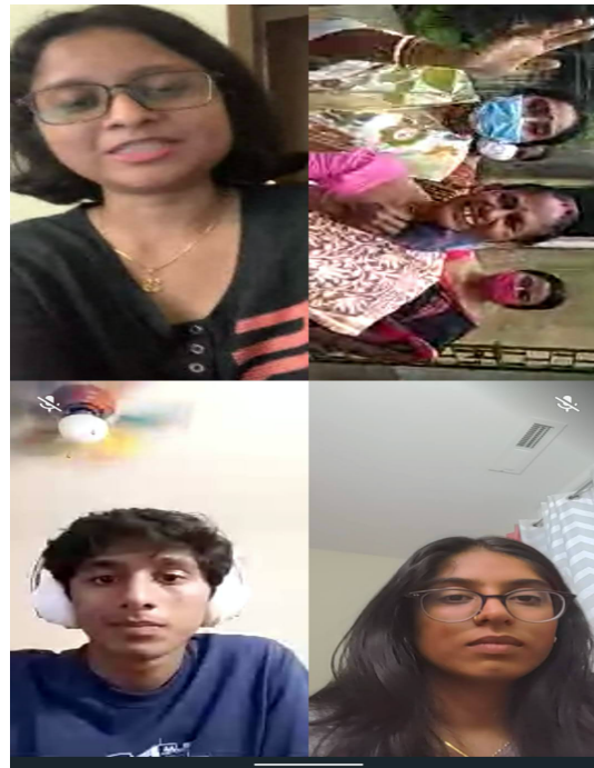
4. Teachers in conversation with ASHA, UIUC