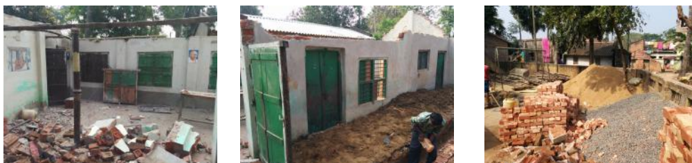
Figure 1: The construction works going on at Balia

The pre-primary school at Balia was undergoing re-construction using funds from last year's approved budget. Construction started from January 6 th , 2016. It entailed completely destroying the previous structure (which was in a very deplorable condition) and building a school building, proper playground and a lavatory on a new foundation (which was being laid during my site visit). Some pictures of construction are given in Figure 1. As of the latest update in May, painting and final touches were being finished. School was expected to resume very soon.