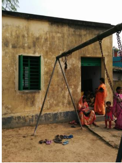
Figure 4: Class going on at the warehouse in Bahirkhand