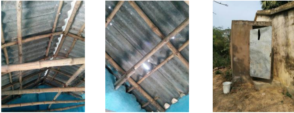
Figure 3: The deplorable conditions of the building at Narayanpur

The pre-primary school at Narayanpur was one of the BGUS members' main points of concern. A small amount was kept in last year's approved budget for renovation of this school building, which was barely enough for construction on the warehouse beside the school building so that it can be used as a classroom or a kitchen space. Constructions were to start on the godown (warehouse) to convert it to a school usable room. However the main classrooms are also in a very dilapidated condition as can be seen in Figure 3. There were holes in the asbestos of the classroom roof, which posed a big problem in the monsoon season. There are also cracks in the roof and wall which raises security concerns of the building. There is also no supply of electricity in this part of the village. Funds for construction of the Narayanpur school and arranging for electricity lines was included in the 2016 proposed budget. This was one of the urgent requirements of the project.