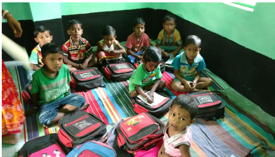
Figure 1: Schools in Narayanpur and Balia during classtime

There was tremendous positive response and sense of gratitude from the