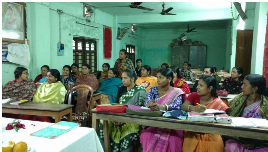
Figure 4: Deplorable conditions in the classroom shed