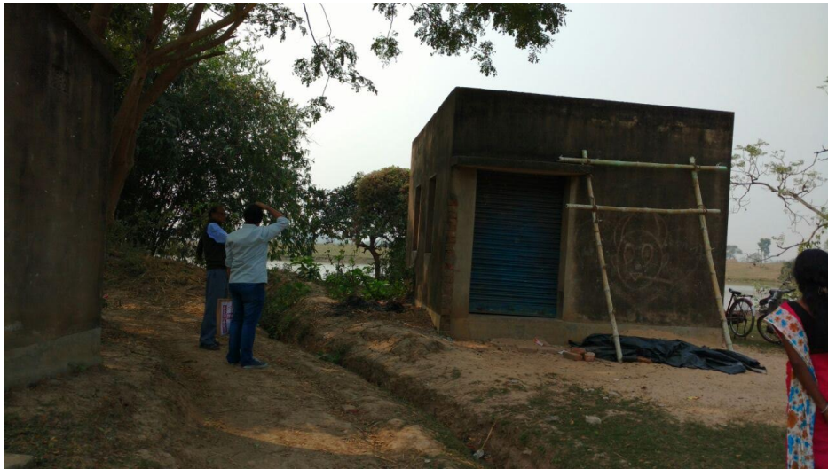
Figure 2: Electricity being installed in the school premises

Last year, this was a major point of concerns from the project sites at Bahirkhand, Dullya and Narayanpur. Absence of electricity and proper water lines were hindering classes during cloudy or rainy days. With some of the funds sent last year, they were able to sanction the installment of electricity lines and have already commissioned workers for the installment of electricity lines. This year, they intend to finish the electricity projects at Balia, Jigra, Ichapur and Kashipur. Funds for such installations have been requested in the budget proposal. These seem to be very necessary for the unhindered schooling at these villages.