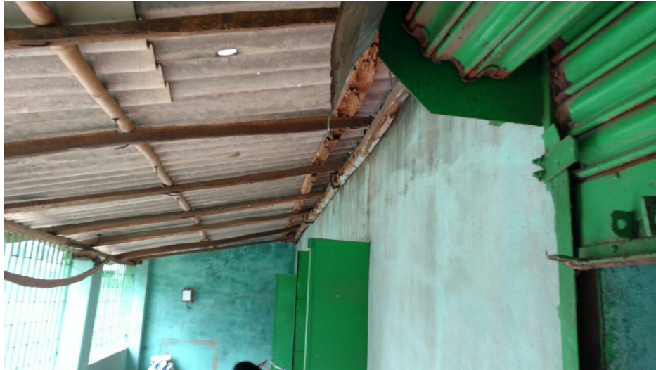
Figure 3: Deplorable conditions in the classroom shed