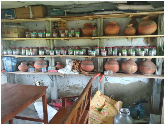
Mukti seed bank at the SAM field office