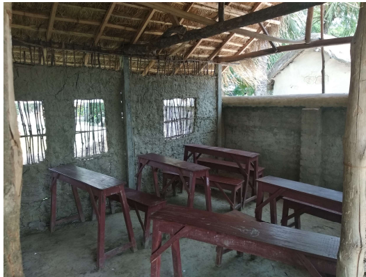
One of the coaching centres at SAM field office