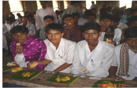
Meal Supplied during this Coaching Program

Each centre provided coaching to 120 Students. Each group of 120 students included 20 students from class V to X. Twelve teachers, two coordinators and 2 assistants were recruited by Mukti. Mathematics and English were taught in the morning classes every day. Mukti Book bank