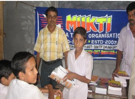
Book Bank Project at Bankura

primary focus is on supporting and strengthening school education (including financial support to talented, but desperately needy students) as a means of reducing poverty. Mukti's programs also include training in and propagation of improved agricultural, fishery and bee-keeping techniques to increase yields and income.