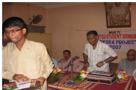
TSS program in Bankura

M u k t i found many students in Nagendrapur GP and Kankandighi GP, who were talented and excelling in their academics but having difficulties to continue their education further because of the poor financial condition of