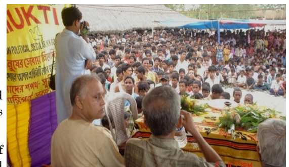
Book Bank 2007 - 2008