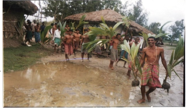
Coconut Plantation Project

coconut tree nursery and by-product industry in different parts of Sunderban, India in future. Mukti believes this project can help people of Sunderban in following ways: