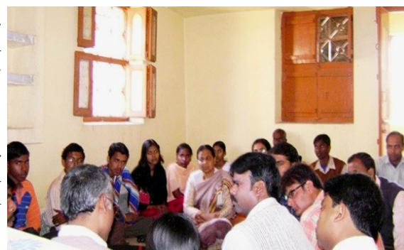
Mukti Bankura Chapter General Meeting

Mukti volunteer committed to extend Mukti India work in Bankura, especially in Bansidi, Goyaltor and Bankura.