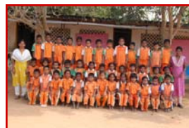
II std @ 2010–2011