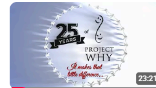
Project WHY 25 Years Event 582 views • 3 months ago