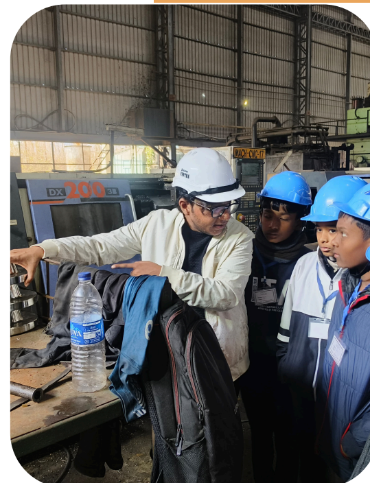
NURTURING ENGINEERING & SPORTS