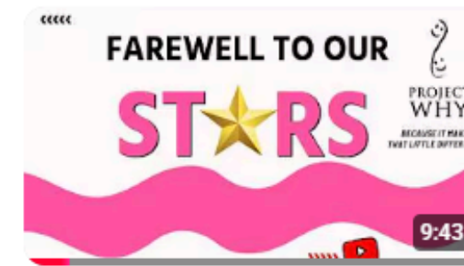
Farewell to our Stars 125 views • 3 weeks ago