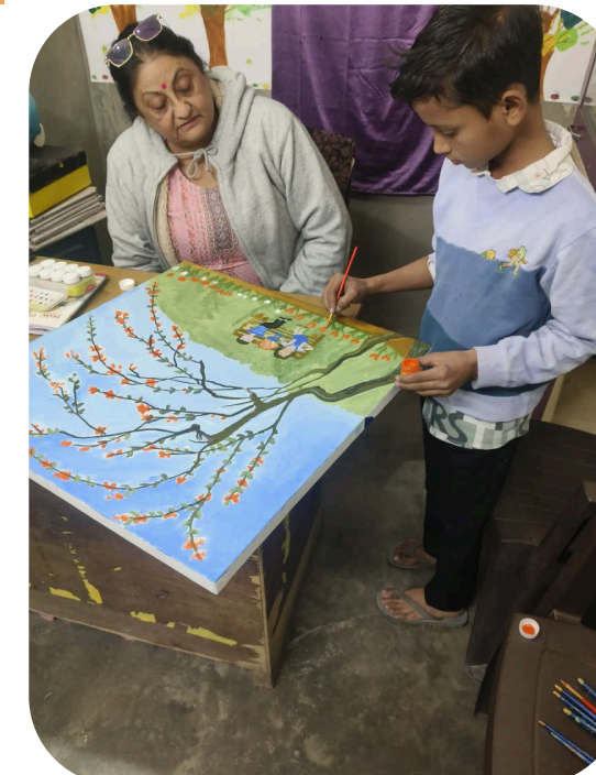
NURTURING ART & PHOTOGRAPHY