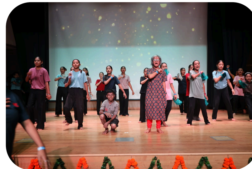
DANCE SHOWCASE ON STAGE

https://drive.google.com/file/d/1PDjOFEOvuF1-zKeNEbT46KoGjYPJC3j5/view?usp=sharing