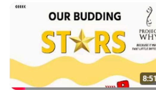
OUR BUDDING STARS 213 views • 1 month ago