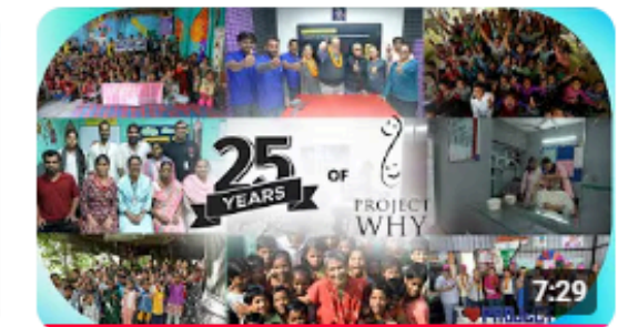
Project WHY 25 Year Journey 436 views • 4 months ago