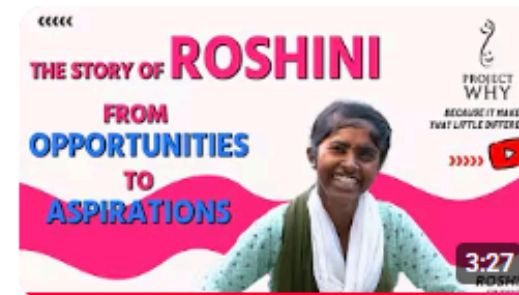
The story of Roshini | From Opportunities to Aspirations 108 views • 2 months ago