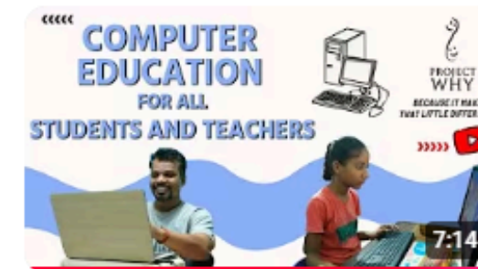
Computer Education for All Teachers and Students 208 views • 3 months ago