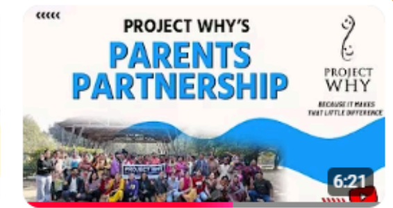
Project WHY's Parents Partnership 180 views • 2 months ago