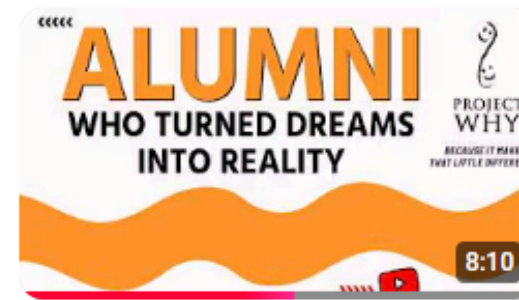
Alumni - Who turned Dreams into Reality 34 views • 4 days ago