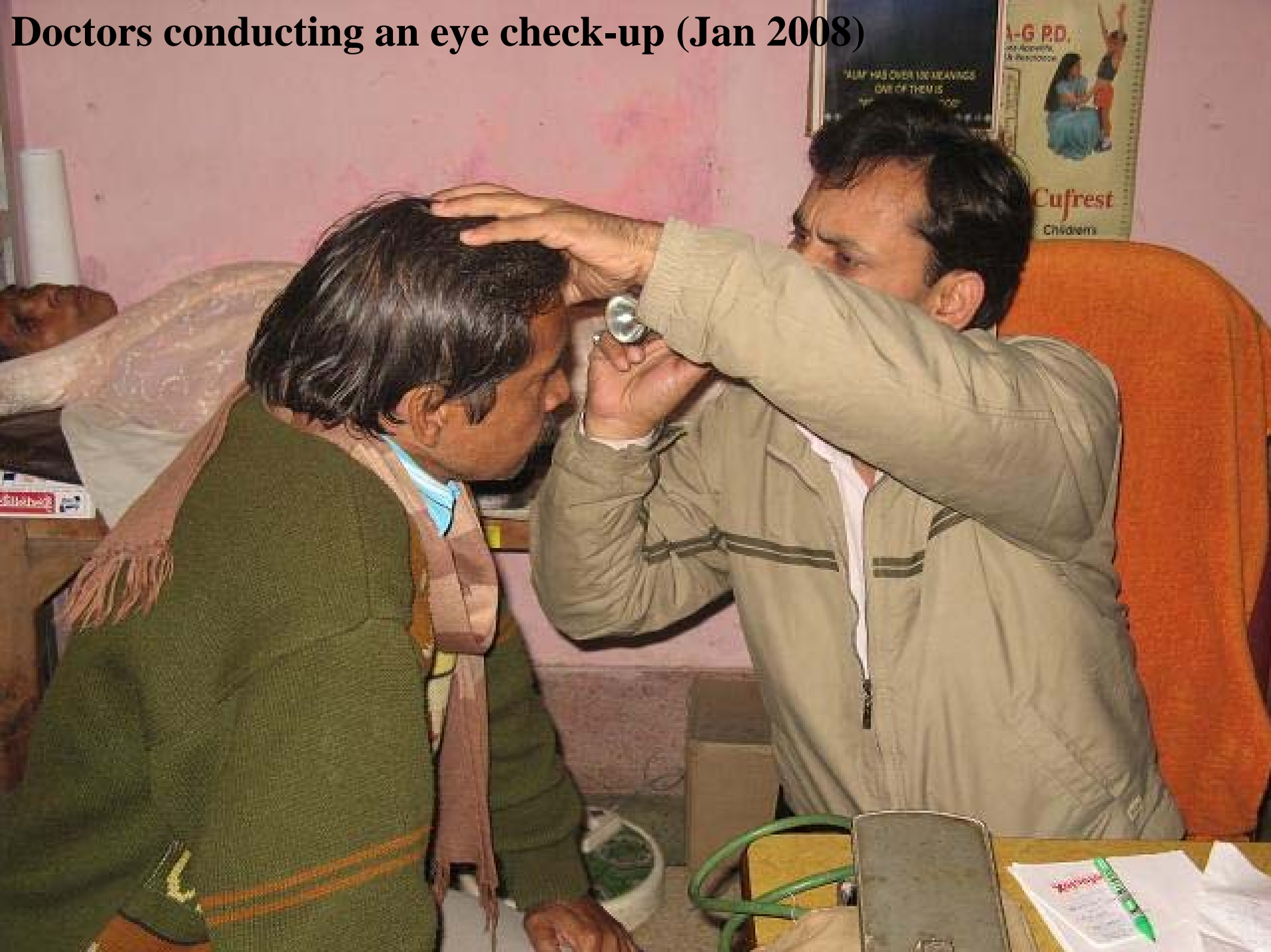
Doctors conducting an eye check-up (Jan 2008)