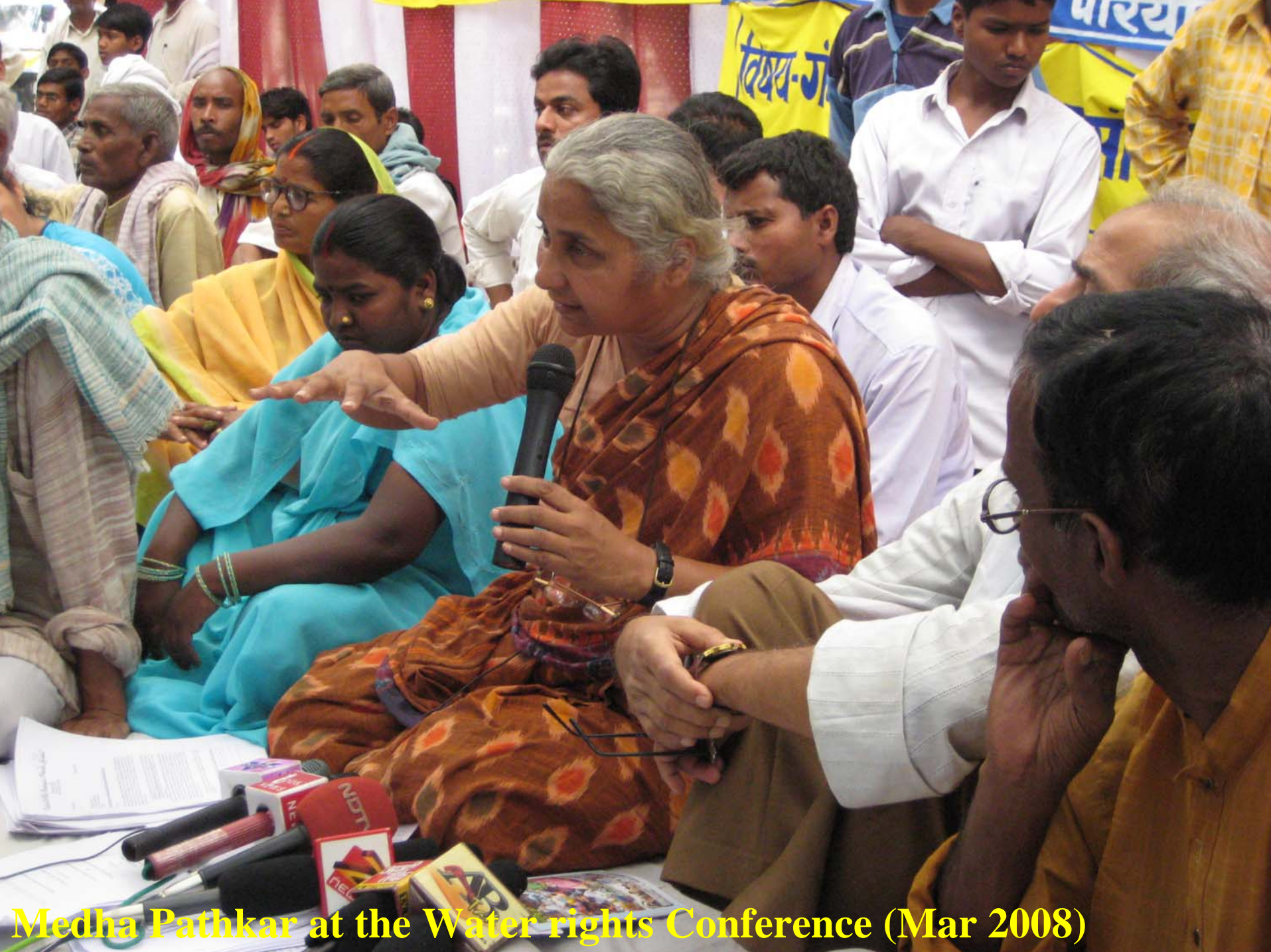
Medha Pathkar at the Water rights Conference (Mar 2008)