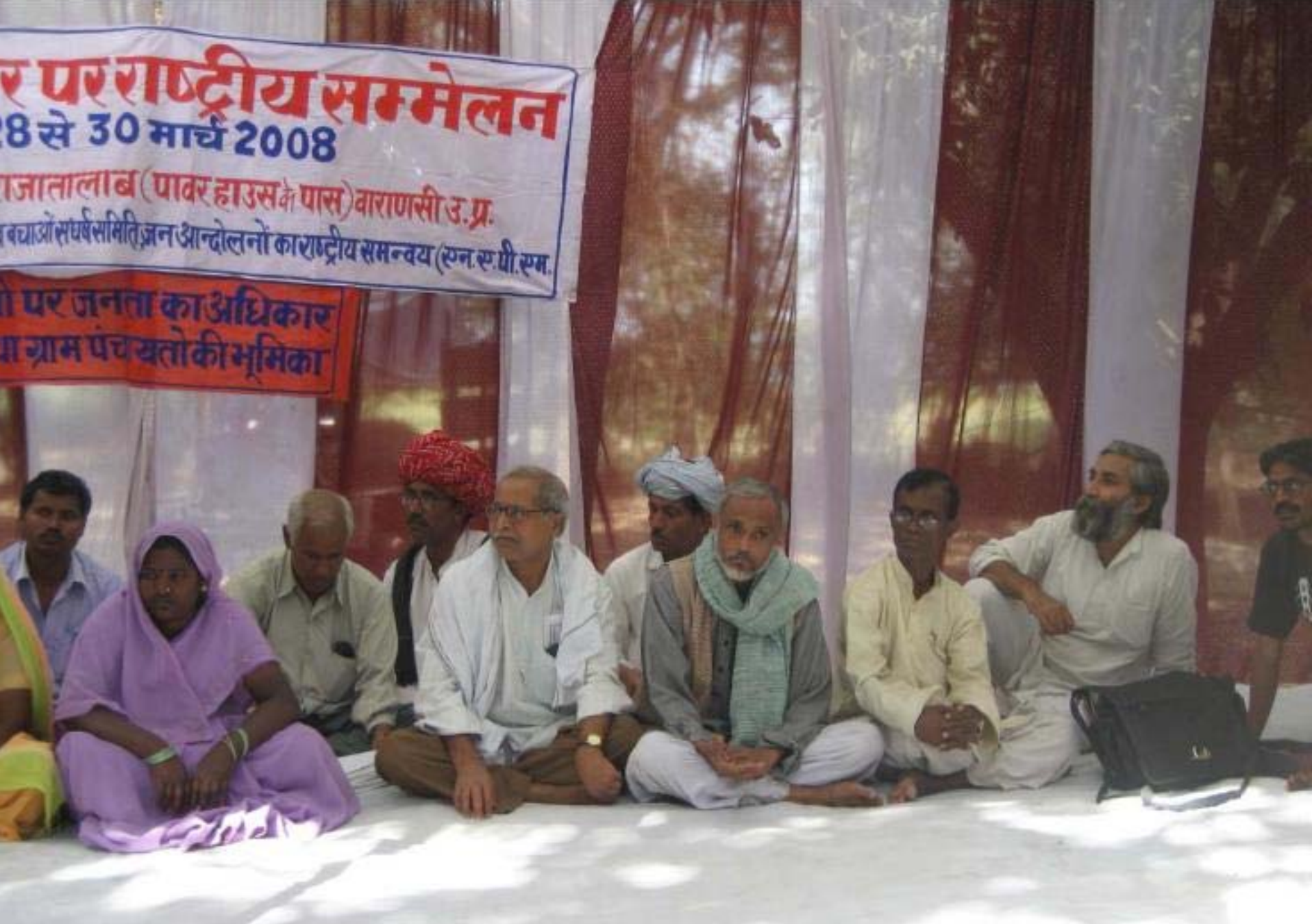
Water Rights Conference (March 2008)