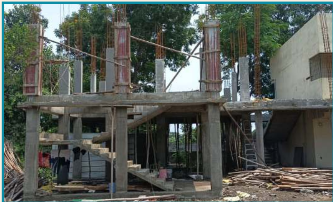
Hostel building under construction.