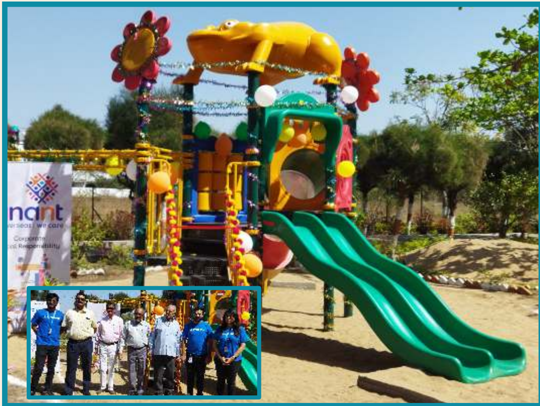
Sensory Park Inauguration (Coral Unit)