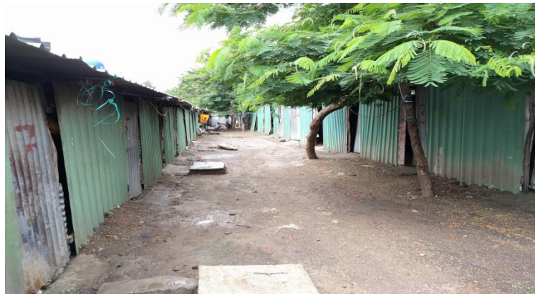
Living quarters of the construction workers and the DSS students.