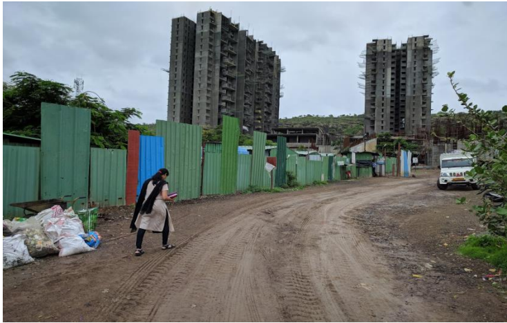
Construction site in Baner. Beyond the green barrier is the accommodation for the construction workers along with the DSS classroom.