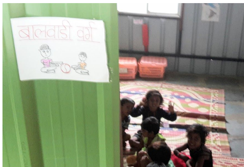
Children in the bālhwāḍī room greeting us

DSS uses one of the rooms as a creche for the infants, and the other two rooms for educational activities for the school-age children -- one room for bālhwāḍī (kindergarten classes for ages 3-6), and the other for literacy/study classes for ages 6+.