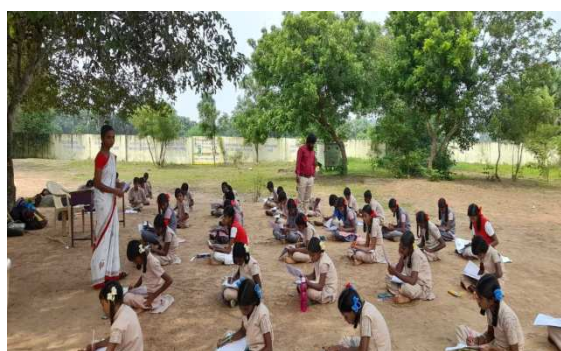
SMART @ Neelamangalam

SMART tests were restarted after the pandemic for students of classes 6,7,8 and 9th. Top 10 rankers from 27 schools, totalling about 1000 students took up SMART tests conducted during November 2022, January 2023 and February 2023. Periodic visits to the schools were made to assess the teacher performance real time, in the class room. It was heartening to notice during class room visits that the students were slowly getting into class room discipline and learning which took deep dents during the long COVID vacation.