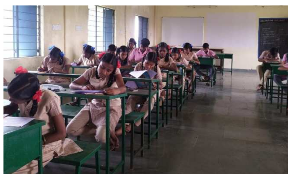
SMART @ Veerapuram