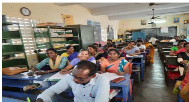
A joyful session...