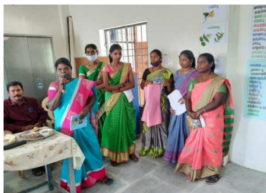
Presentation of the Project on Flowers