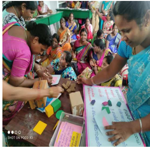
Primary teachers- Aids to teach Symmetry