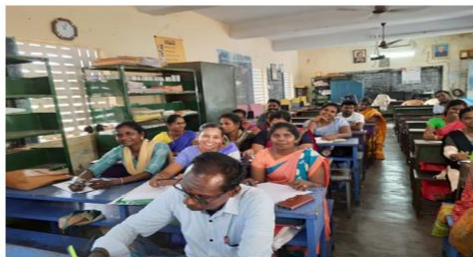
A joyful session...