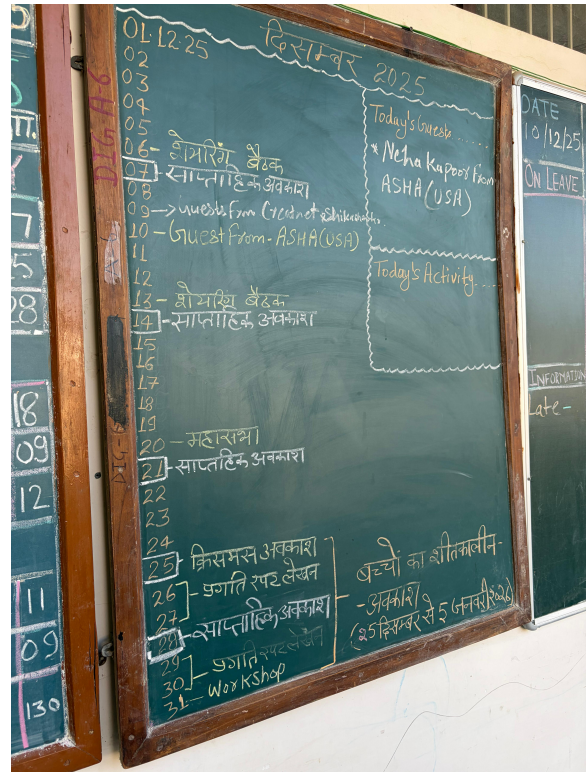
Classroom chalkboards used for daily thought, lesson work and planning.