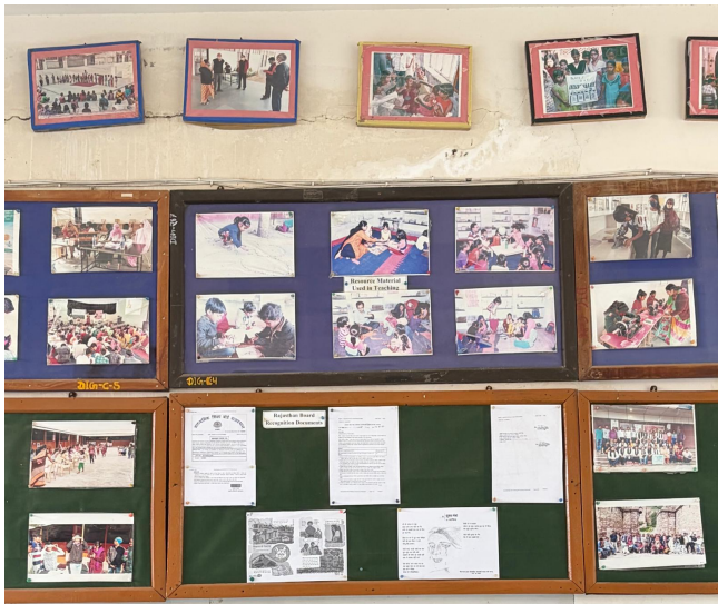
Photo and activity display boards mounted across a common area.