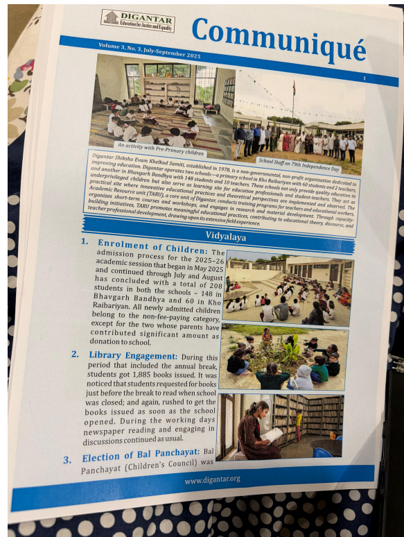
Communiqué highlighting enrolment, library engagement and school activities.