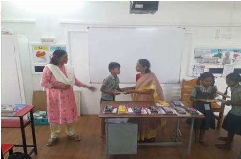
CPS Shastri Nagar