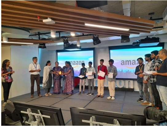
Olcott School team with the prize