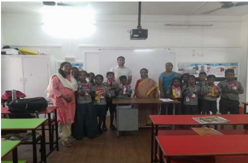
CPS Shastri Nagar