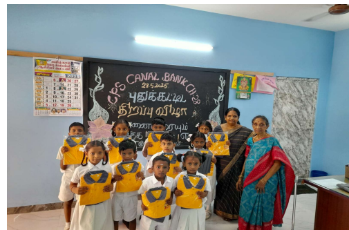
CPS Canal Bank