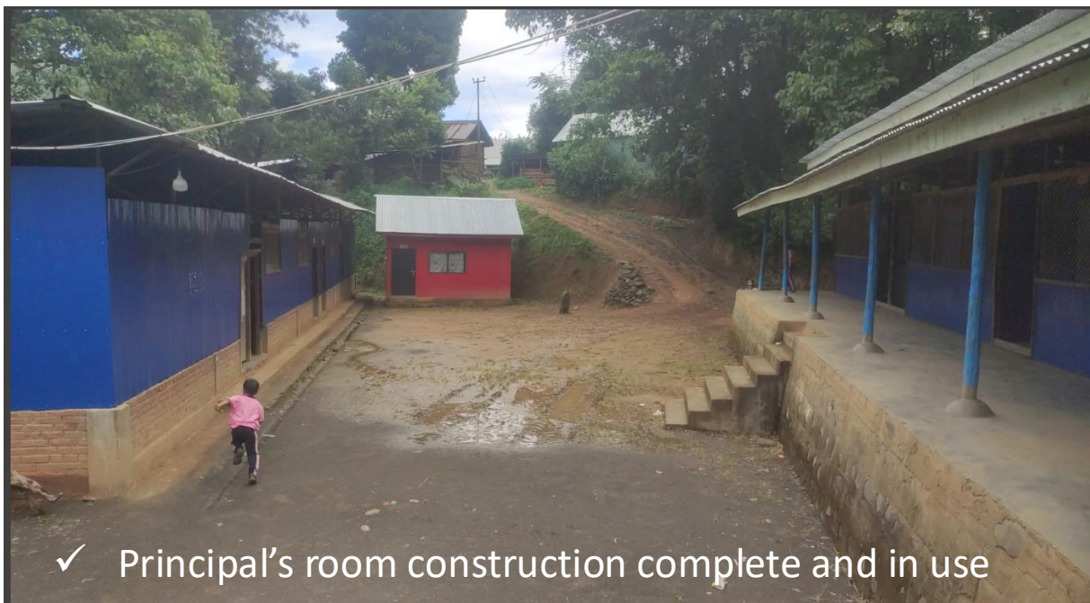
✓ Principal's room construction complete and in use