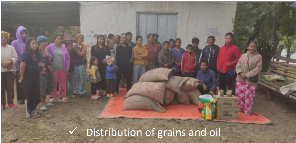
✓ Distribution of grains and oil