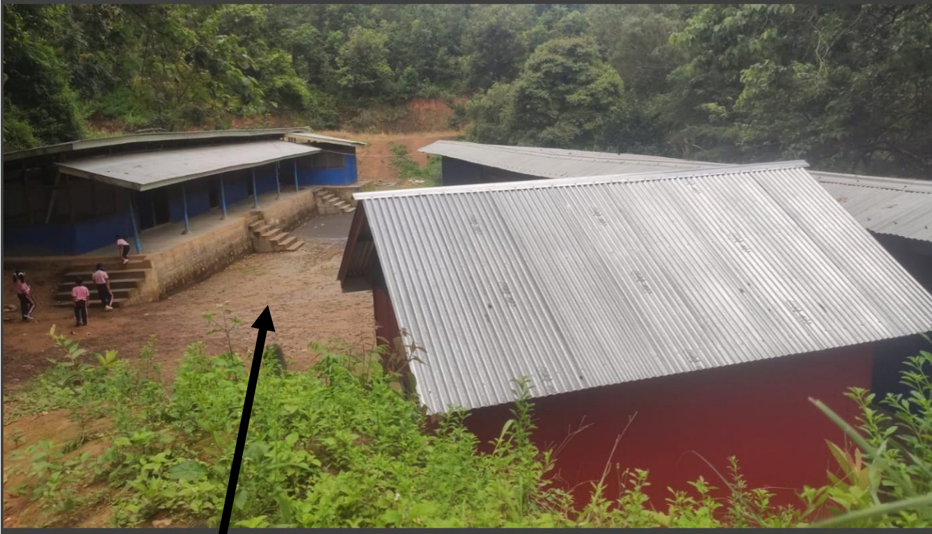
Proposed quadrangle spot for construction

Quote from Joy, with permission to share: