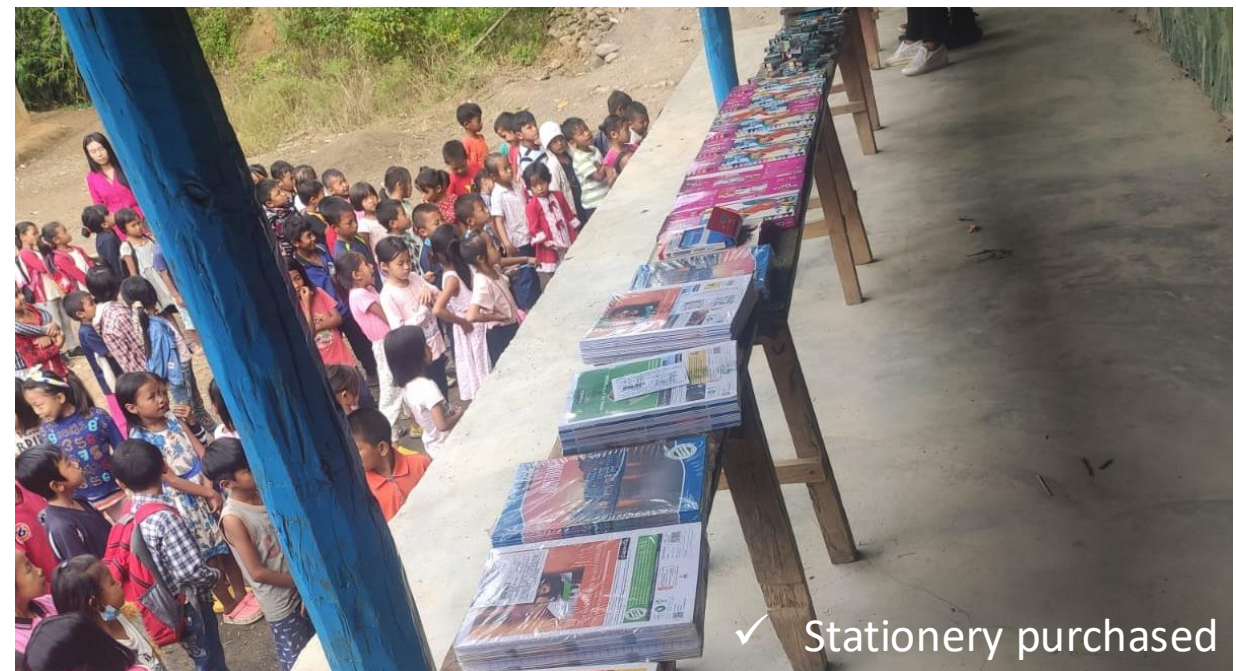
✓ Stationery purchased