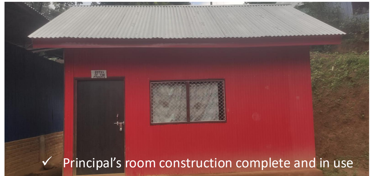
✓ Principal's room construction complete and in use