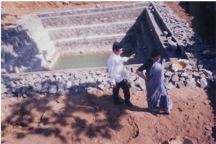
Water harvest project (4)