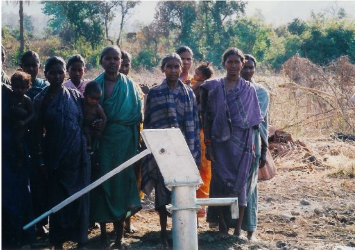
Tubewell for drinking water (54)