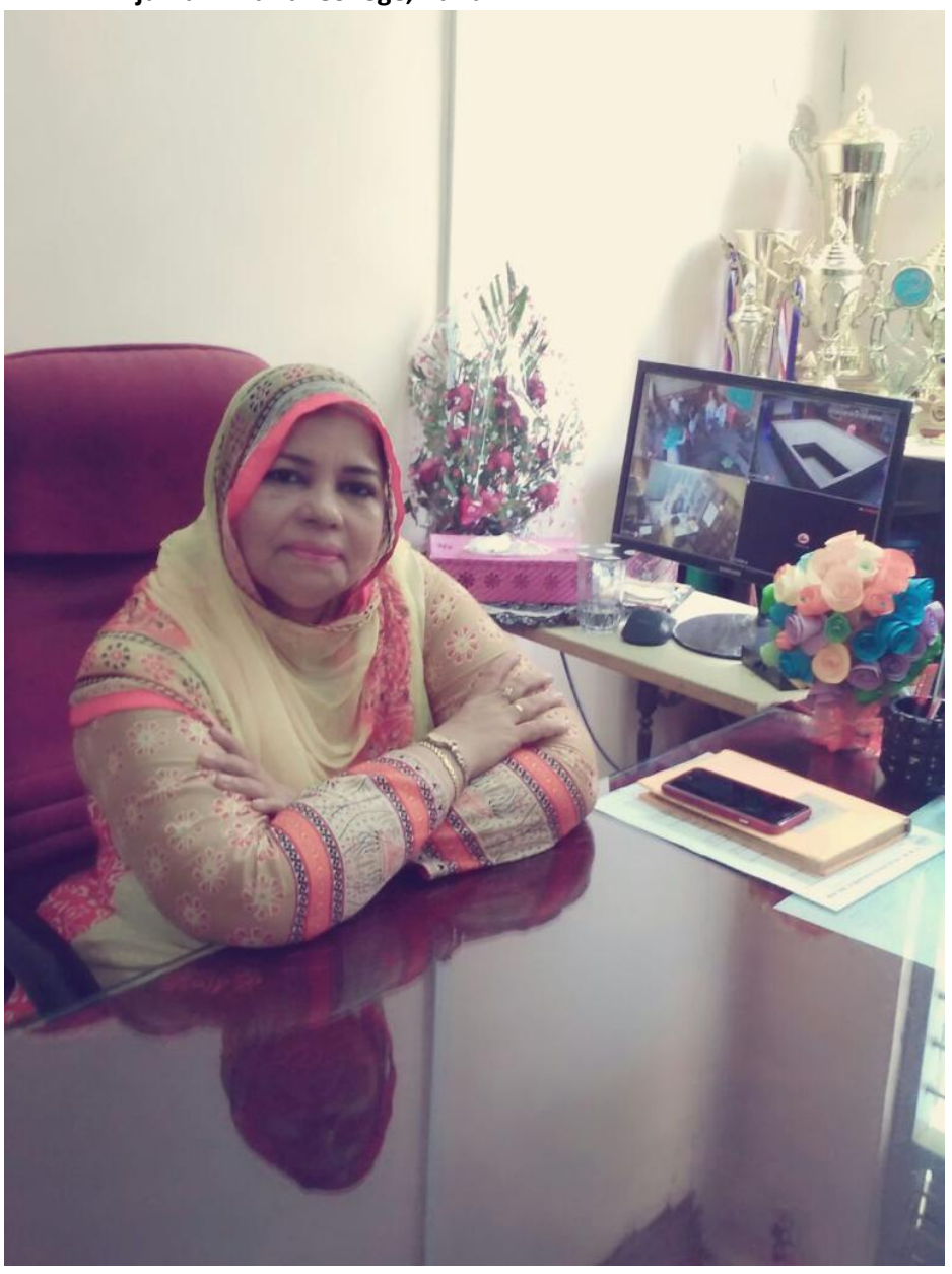
--End of document--