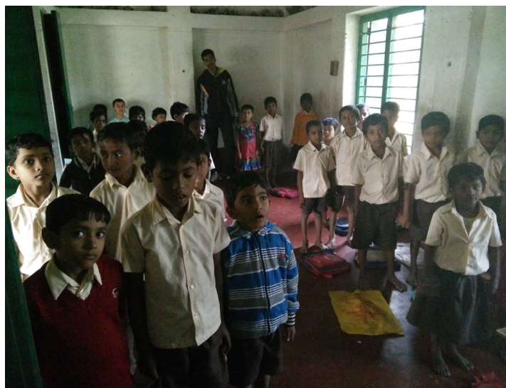
Figure 3: Students greeting us in class on the ground-floor.