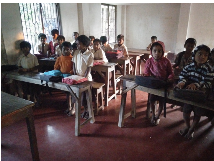
Figure 2: Students greeting us in a class on the first-floor.