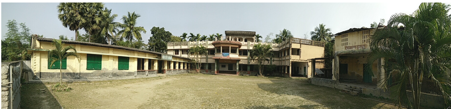
Figure 1: A View of the BTS-PathBhavan from the entrance.