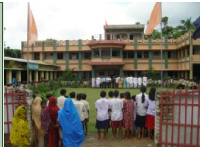
Guest from Sir Dorabji Tata Trust, Mumbai