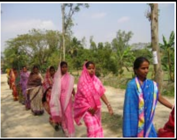
BTS is now taking initiatives to have Bank Link-age of efficient groups(SHG) for further finan-cial supports/credits to promote livelihood op-portunities and stop migration to urban