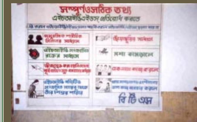
HIV/AIDS Sensitisation by BTS-Sunderban