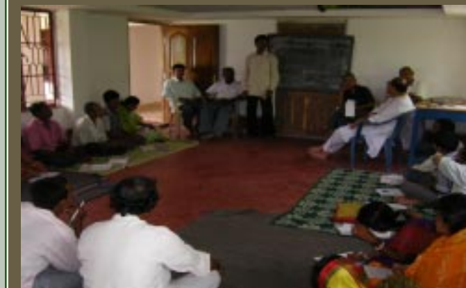
Annual Meet of BTS-Volunteers and GB Members