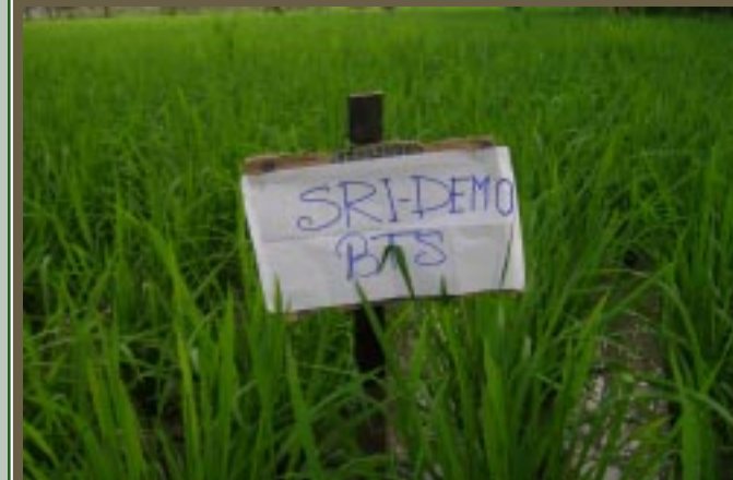
Demo at BTS-Farm on SRI