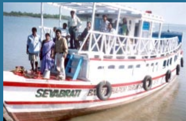
BTS-Medical Boat Dispensary for Island Camps