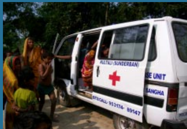
BTS-Ambulance is in service to the Community