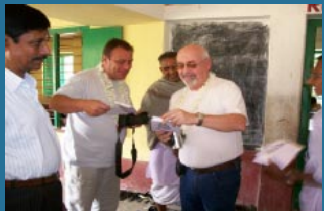
Visitors from Brussels visiting BTS-PathBhavan