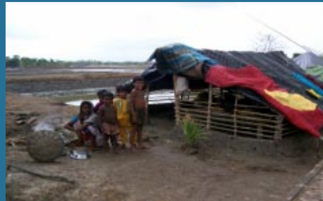
Aila 2009 ravage shock still in their mind

AVARD - New Delhi RURAL DEV. CONSORTIUM SHG PROMOTIONAL FORUM STATE IAG - West Bengal