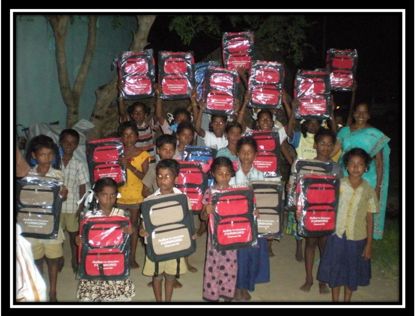
Pic 4: Mohalwadi. Happy Kids with their school bags 😊