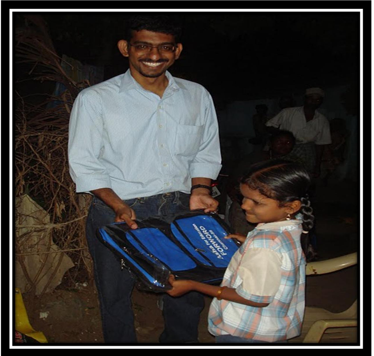
Pic 2: Pazhani at Pulikoradu