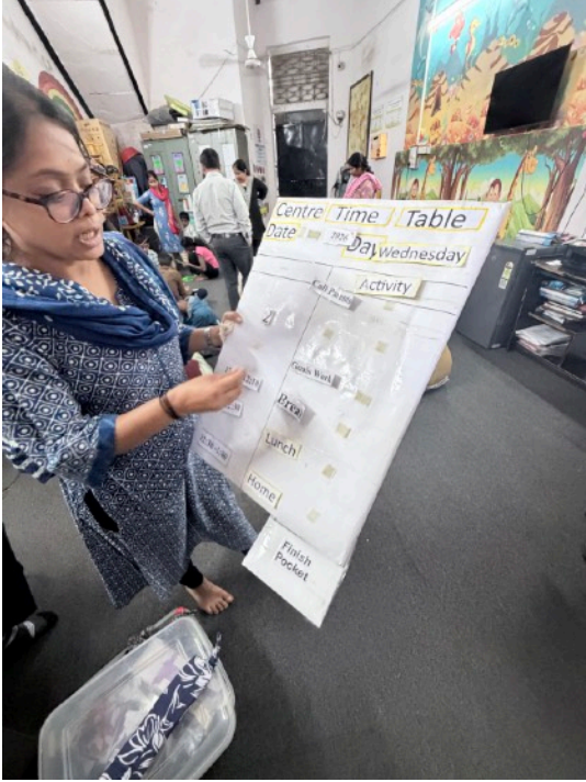
Mamuni displaying a time table that cohorts use for managing schedules