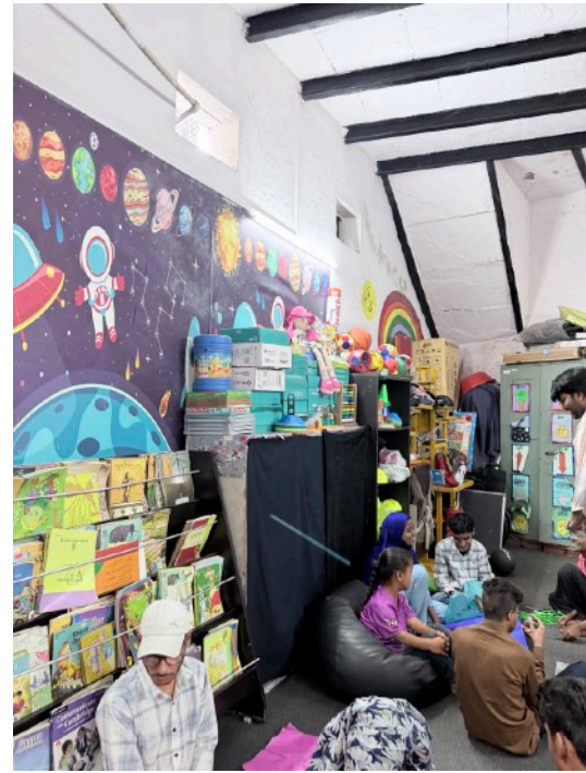
Learning and training material at mazdoor camp