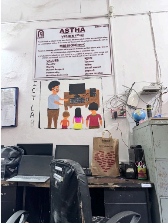
Inoperative computer at the mazdoor camp center