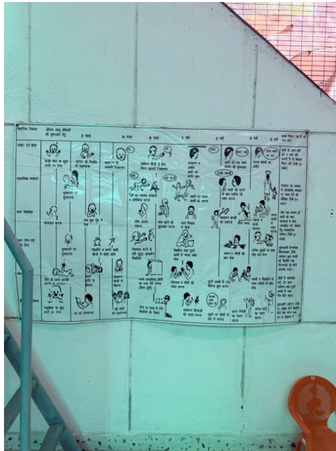
Training material on the wall in the central courtyard of the kakaji center

a recent success story of 8 Astha cohorts securing jobs at Mitti Cafe - a chain of cafes managed entirely by adults with physical or intellectual disabilities. There are quite a few instances of successful training and placement in hospitality sector with Lemon Tree [hotels], and in service delivery segment with Zomato for instance that has served as a strong source of encouragement for the parents as well as sensitized the community at large. Alongside the training and care program there is an emphasis on linking individuals with government grants and schemes, ranging from securing UDID Cards, to applying for pension grants and securing access to local government schemes.