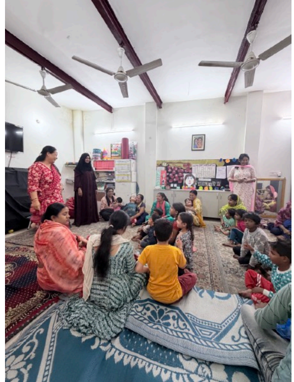
Young children with their parents in the group session