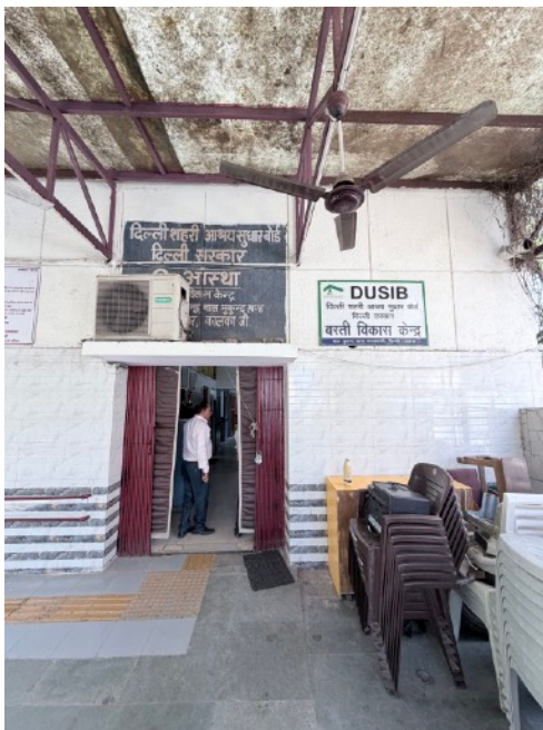
Entrance to the Kalkaji center from the courtyard