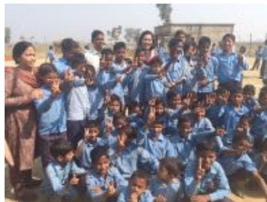
Group photo with boys after a volleyball game