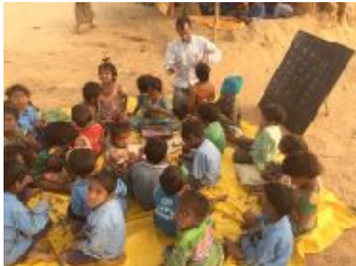
Pre-nursery kids: learning to count through colorful beads

1. There are six classes mostly based on age group but also considering child ability to learn