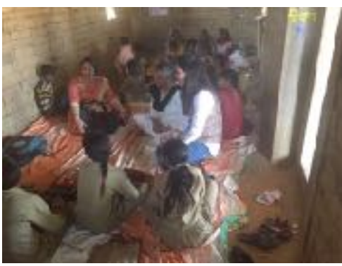
Classroom for classes 3 to 5

Naugarh: After that we went to the Naugarh area and our first stop was Amdaha center: