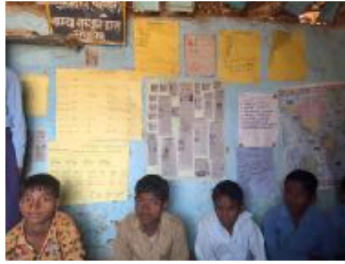
Class 5: Students displaying the charts