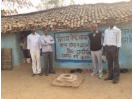
Outside class 5: Teachers