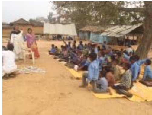
Class 2: Class participation is really good