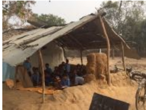
Class 1: Learning to draw