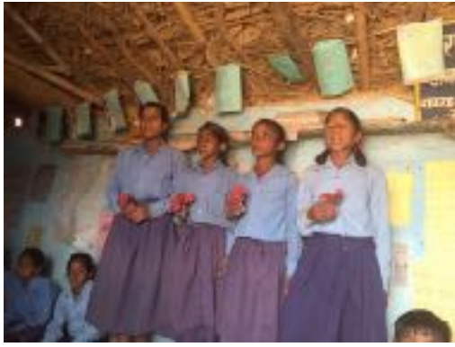
Class 5: Students reciting english poems