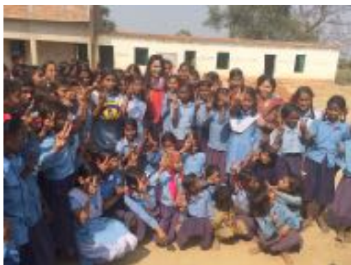
Group photo with girls after a volleyball game