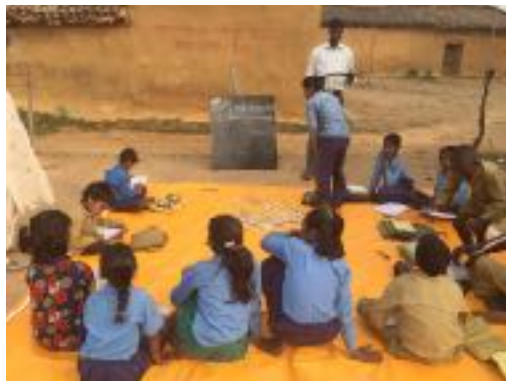
Class 3: Students can write their names in English.