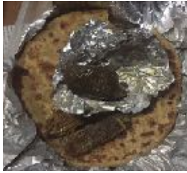
From Basauli center I left to catch train with all the beautiful memories and delicious home cooked Aalu-parantha.