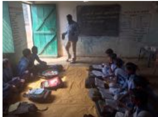
Class 5th studying science