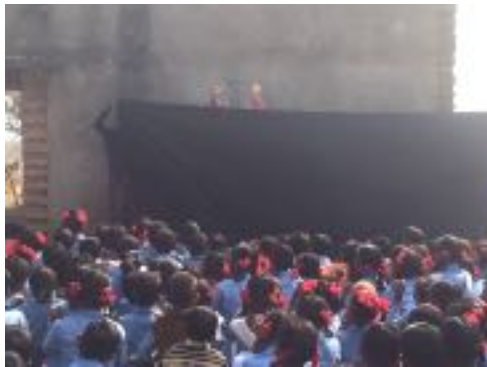
Puppets shows performed by students and teachers to spread

3. I watched a puppet show performed by teachers and students as a team. They use this as a means of communication to educate villagers. For example, at present, they were spreading awareness on voting in elections and not to accept a bribe in return of voting. Students also recited songs on social issues and spreading awareness against dowry and child marriage..