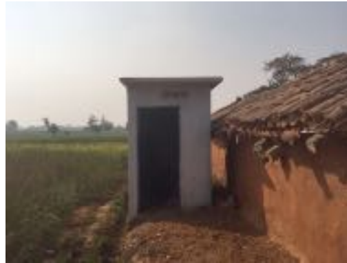
Toilet behind the school building