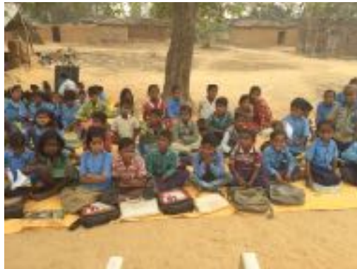
Class 2: Solving basic math questions