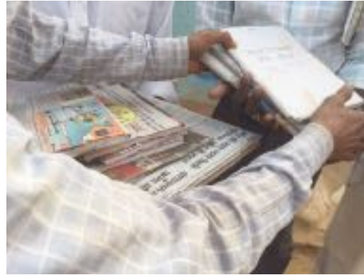
Teachers showing all the documents related to students attendance, syllabus, students progress reports

2. Only one mud building for class 6th. I felt the room is a bit dark to read books. Students can recite English poems. However, their pronunciation is not up to mark because of the strong accent they have due to regional dialect. The class also has a world map where I asked students to locate India, Uttar-Pradesh, USA, and Chicago. They had a hard time but succeeded at the end, which was good to see that they do not give up easily and are eager to learn.