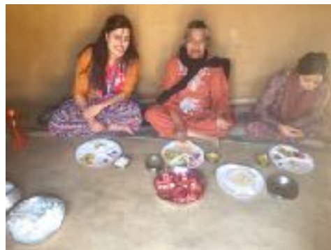
In the end one of the teacher invited us to his house for delicious lunch!