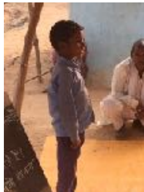
Class 4: Students studying social science