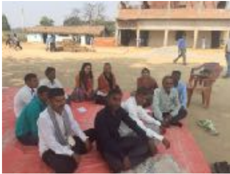
Group meeting with all teachers and staff