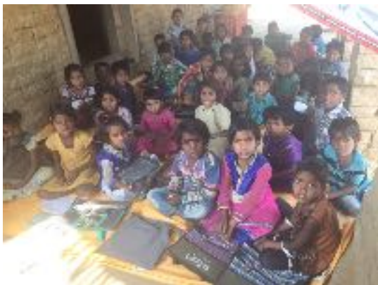
Classes 1 to 2 including precursory kids