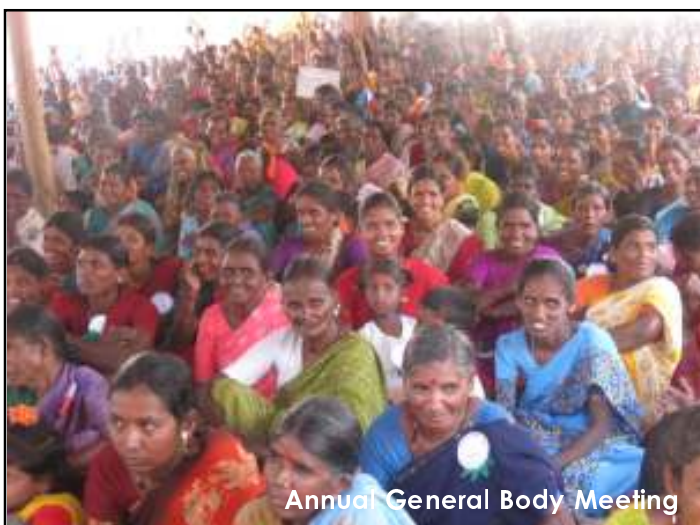
Annual General Body Meeting

During 2008-09, the cooperatives further consolidated their work. As part of a decision to fine-tune and focus its efforts, the Adisakthi Dharani processing and marketing unit promoted by the Adishakti MATCS was handed over to the Dharani FaM Co-op Ltd. The Adishakti MATCS is also looking at alternative arrangements to continue Bhavani , a weaving centre based in Chennekothapalli to provide weaving skills to young girls.