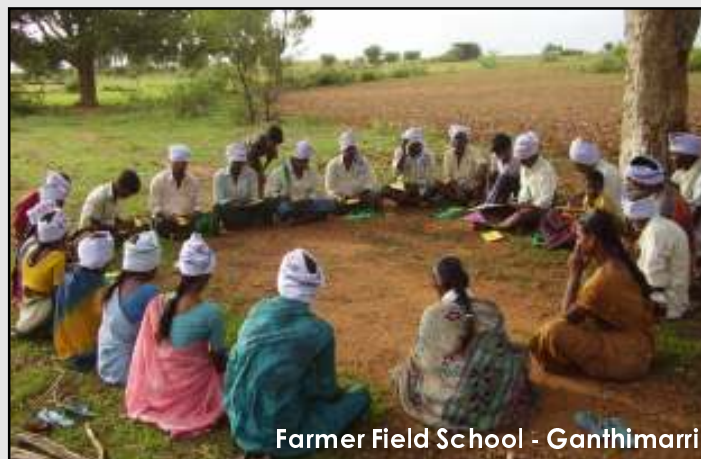
Farmer Field School - Ganthimarri

Training programmes on certification and methodol-