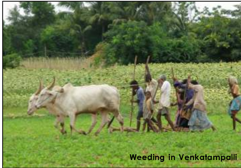
Weeding in Venkatampalli