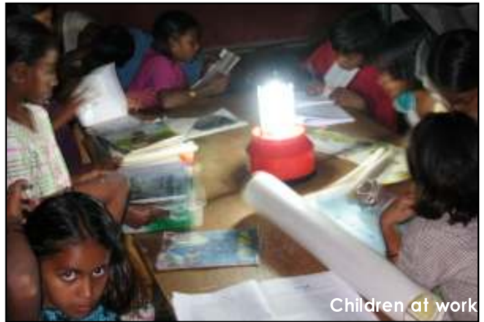
Children at work

The participation of the children in the running of these schools is exceptional - as part of the different