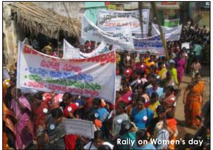
Rally on Women's day

The cooperatives continued to run counseling and legal-aid centers to take up cases of violation of rights of women. These centres provide a space for women to share their problems and seek solutions. Among the three legal-aid centres, the