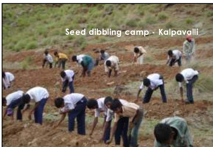
Seed dibbling camp - Kalpavalli