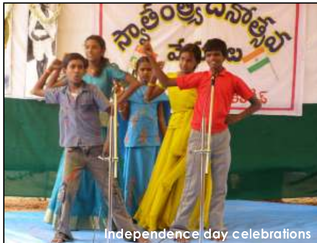
Independence day celebrations

is to facilitate the appreciation of local culture, develop creativity and build leadership skills on the basis of co-operation. The special events celebrated included children's day, independence day, sports festivals, puppet shows, various cultural programmes and the Chiguru annual day. A Paryavarana [environment] camp was held for children from the 6th to 10th standards in June '08 to increase their awareness of the environment.