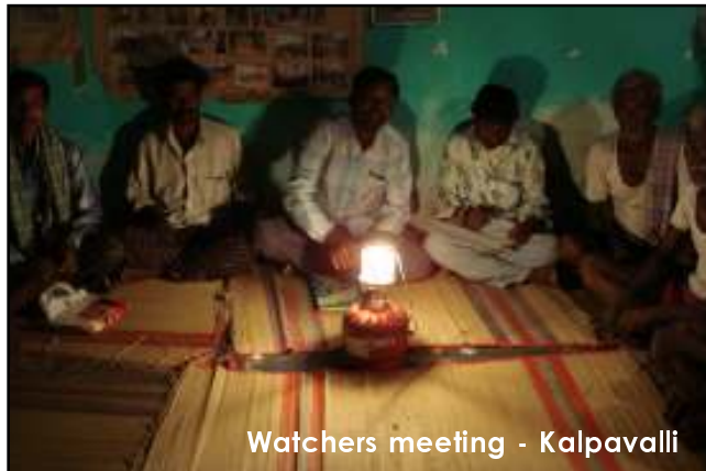
Watchers meeting - Kalpavalli