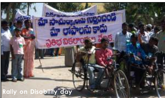
Rally on Disability day