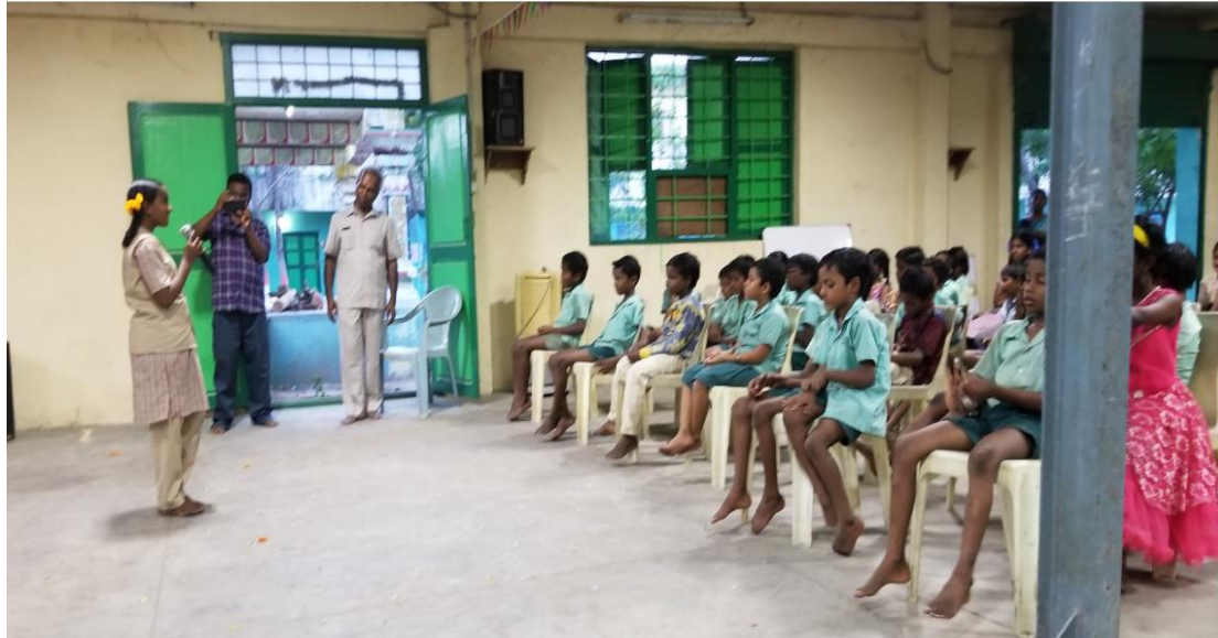
6) Cultural program