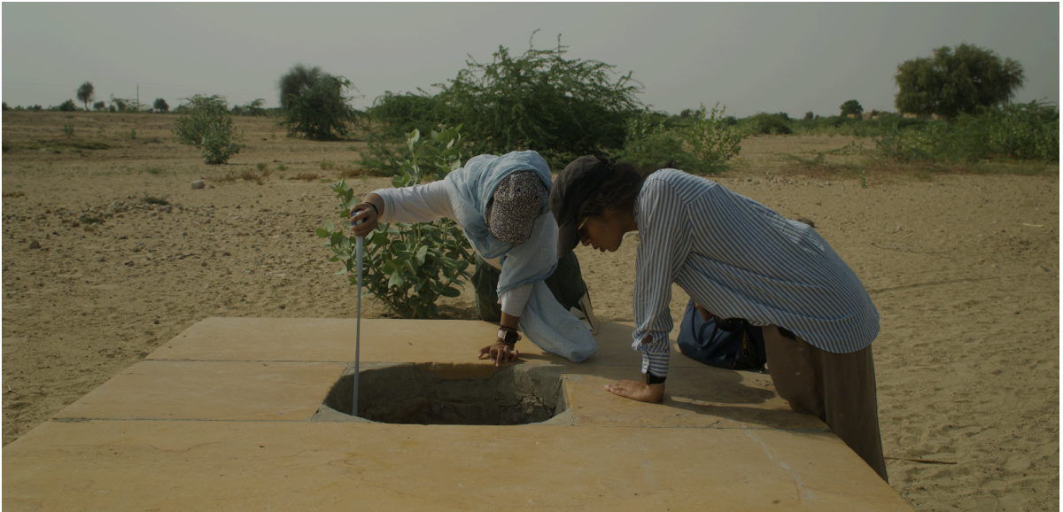
Well depths and make were studied