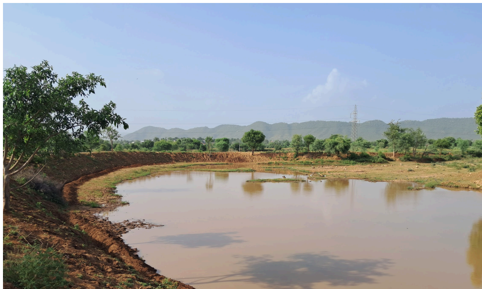
A newly constructed Johad or pond