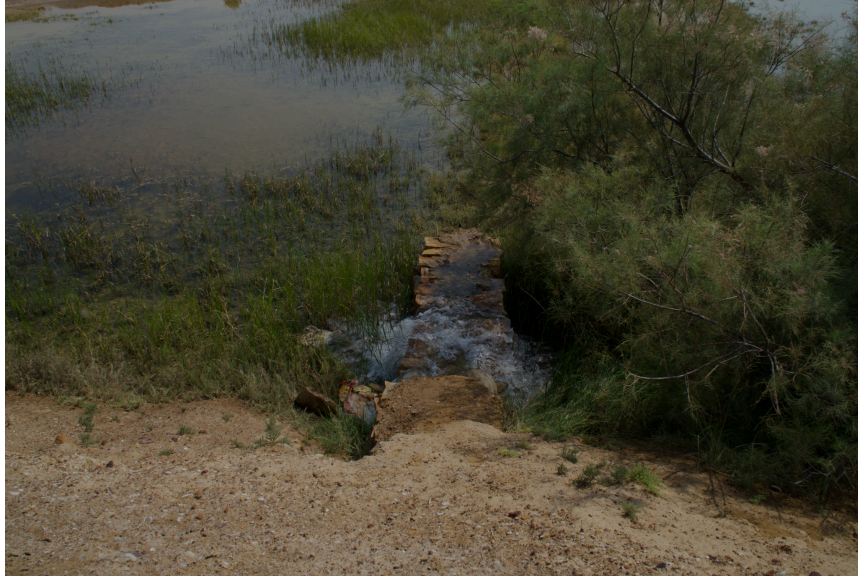
Stone masonry chaddars were constructed to drain the excess water from the Khadeen