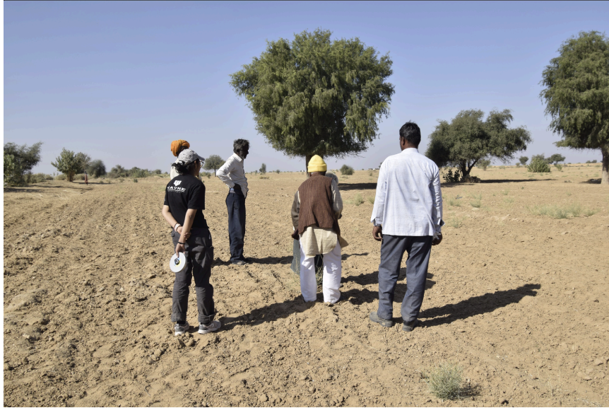
Discussion with the families on the agricultural practices that can be adopted in the khadeens