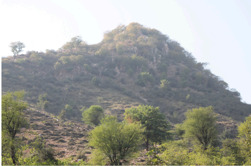
Protected forest lands