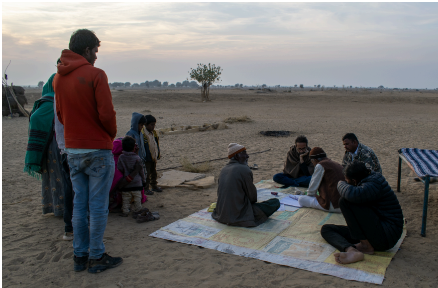
Discussions on the khadeen with multiple members of the family