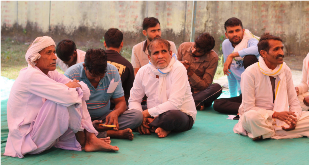
Gram sabha organised to discuss roles and responsibilities, Alwar