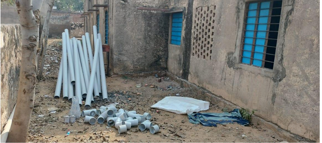
New pipes were used to collect water from the terraces of the school building to the tanks