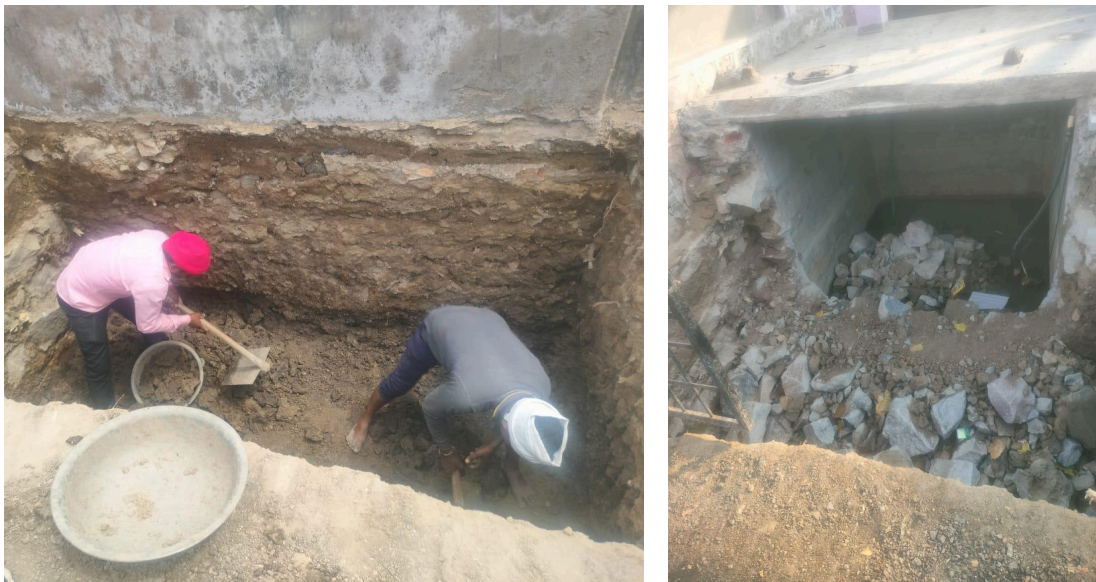
Renovation and expansion of existing tanks in the schools