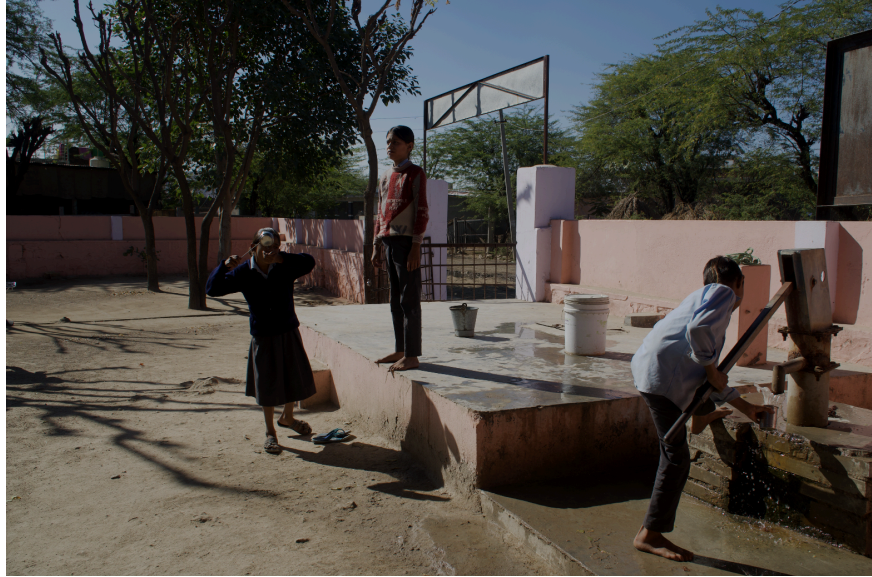
Drinking water is stored in the renovated tank to be used through the year