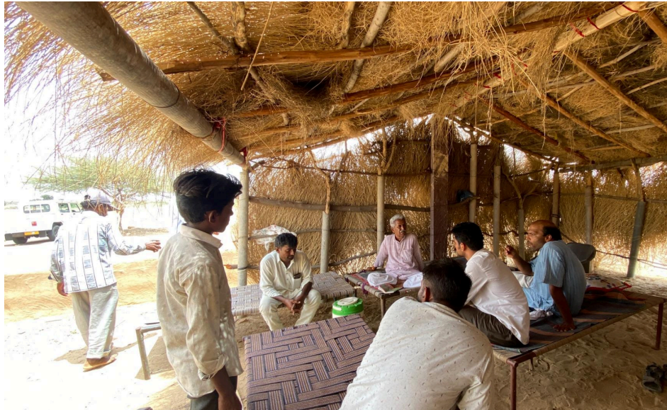
Socio-economic survey conducted with one of the beneficiary families in Jaisalmer