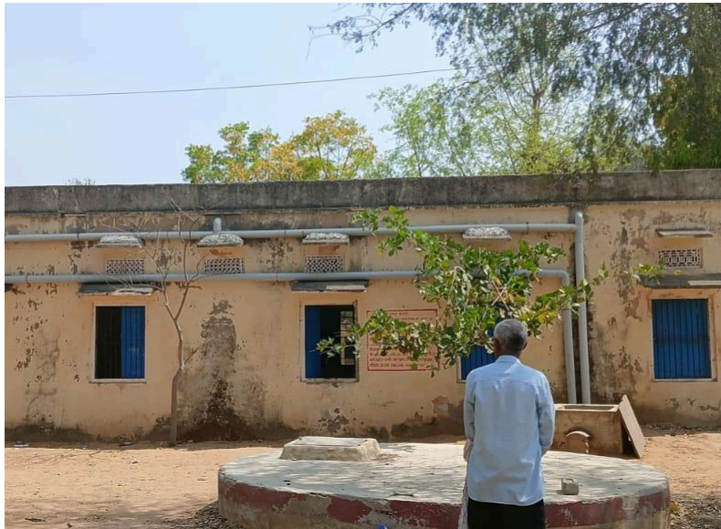
Pipes from the terraces were connected to the tanks to harvest rainwater