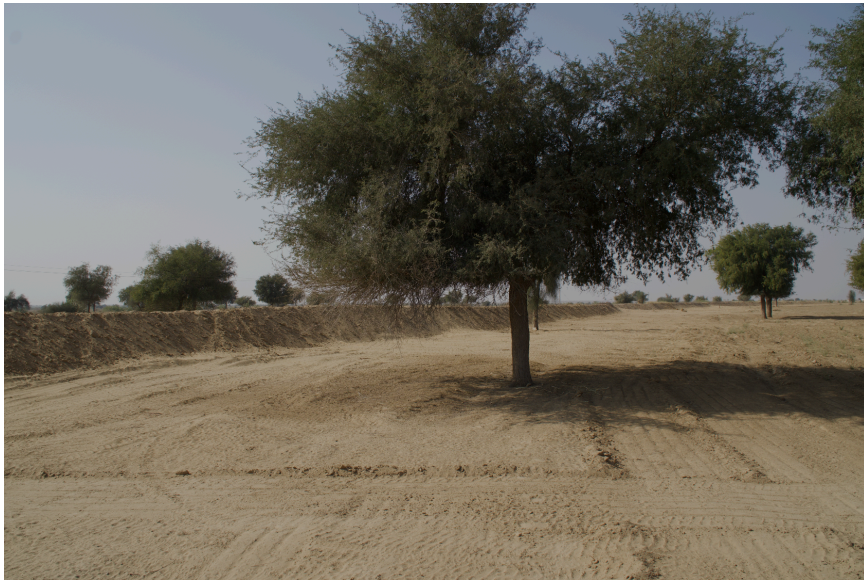
Newly constructed earthen embankment of a khadeen in Jaisalmer