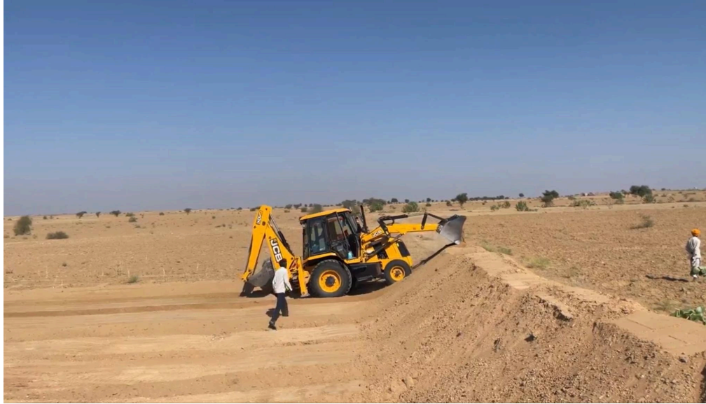
JCBs were used to construct the earthen embankment of the Khadeen in Jaisalmer