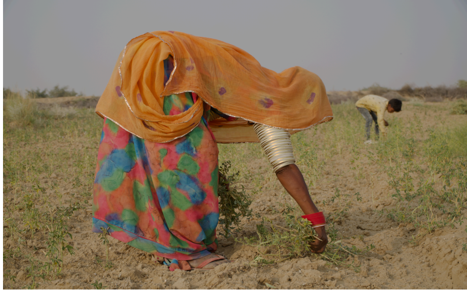
Harvesting channa from the khadeen