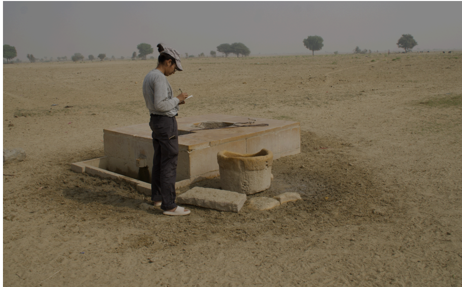
The team on the ground documented wells through audio-visual means