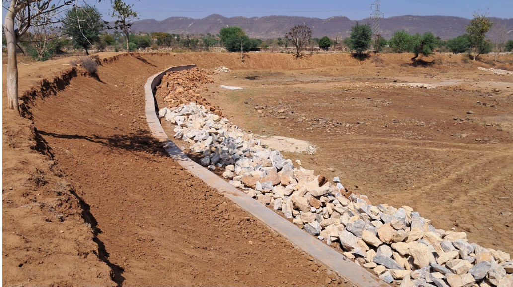
Making of a Johad, post excavation in Alwar