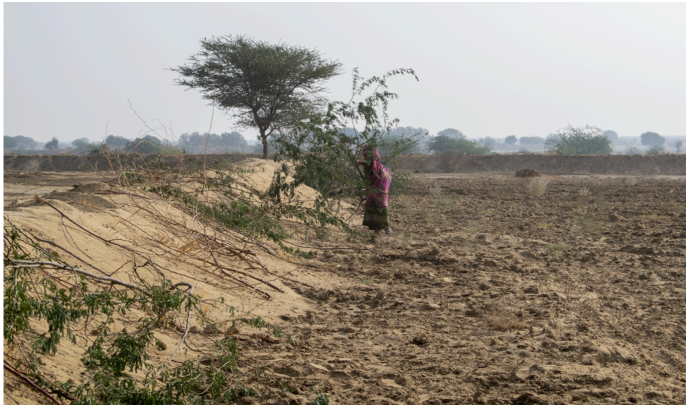
Dhora Chapai was manually done with thorny shrubs and trees in Jaisalmer