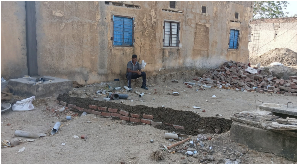
Construction of a drain to connect the water collected from the terrace of the school