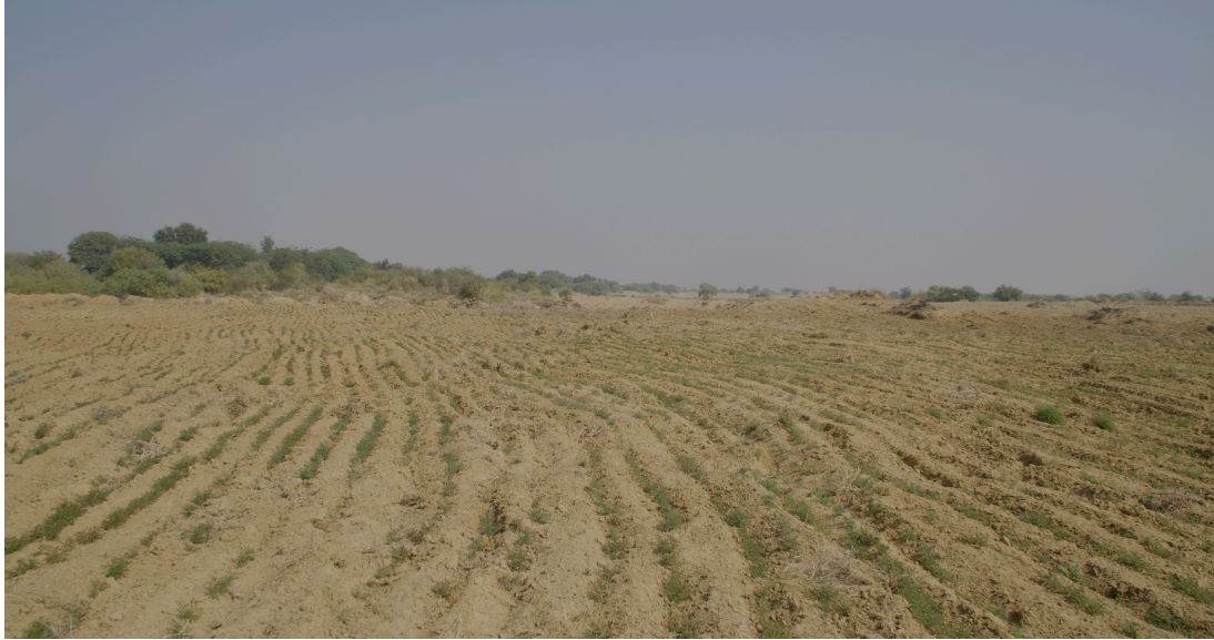
Channa growing in a khadeen in Jaisalmer