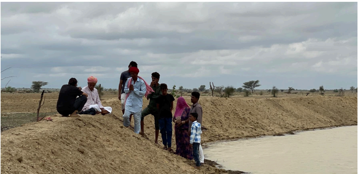
Different community members were interviewed through the fieldwork