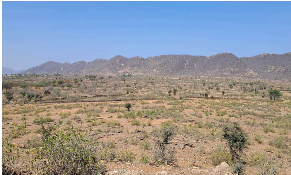
Forest restoration efforts