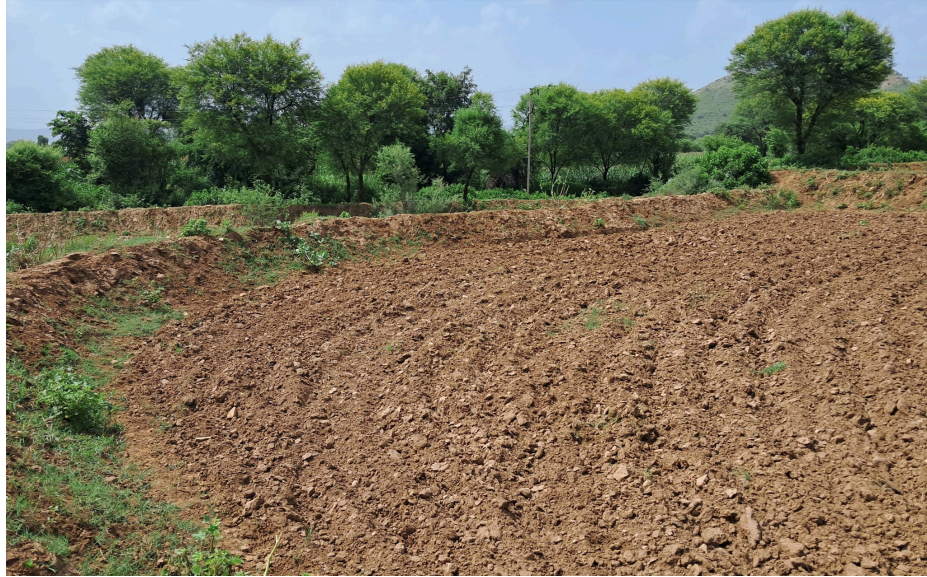
Farm bund near a ploughed field in Alwar