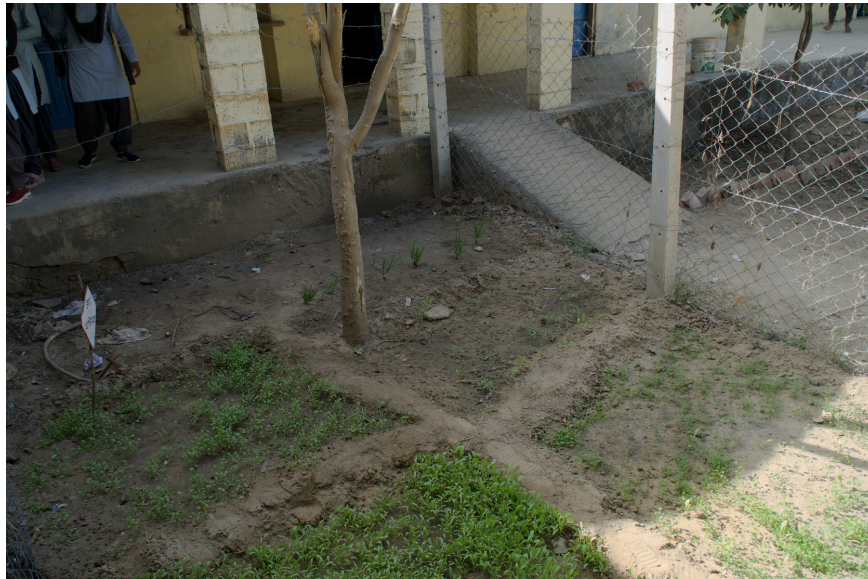
Kitchen garden is maintained by the students