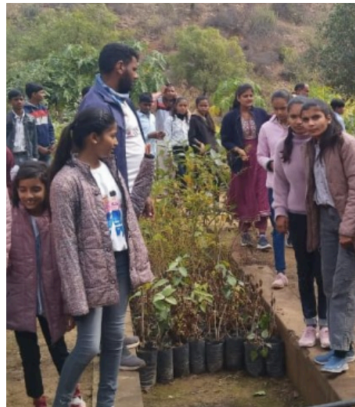
Exposure visits to different schools to understand the different concepts of ecology across Alwar