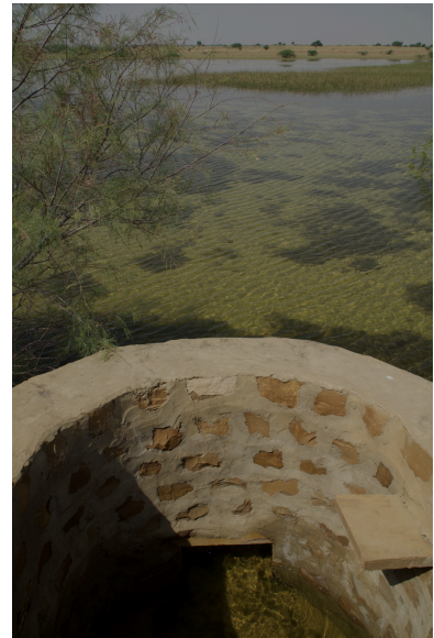
Different forms of Nalas were constructed using stone masonry and cement pipes to drain water from the khadeen