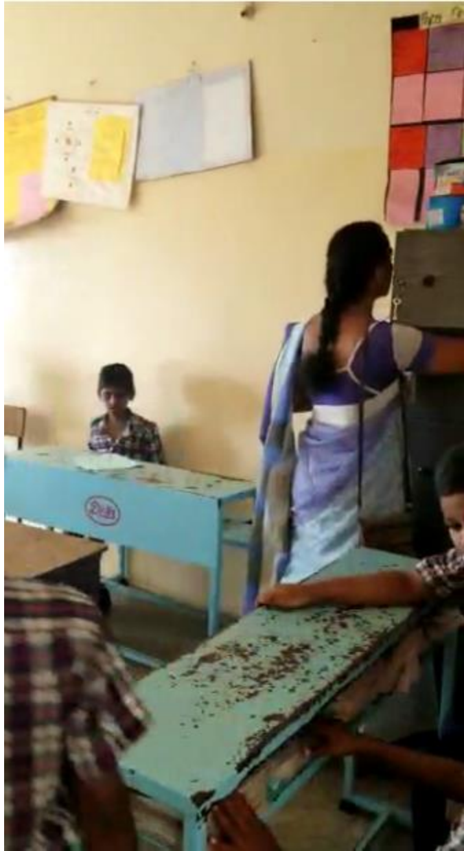
- teacher settling in the class before she starts teaching the kids