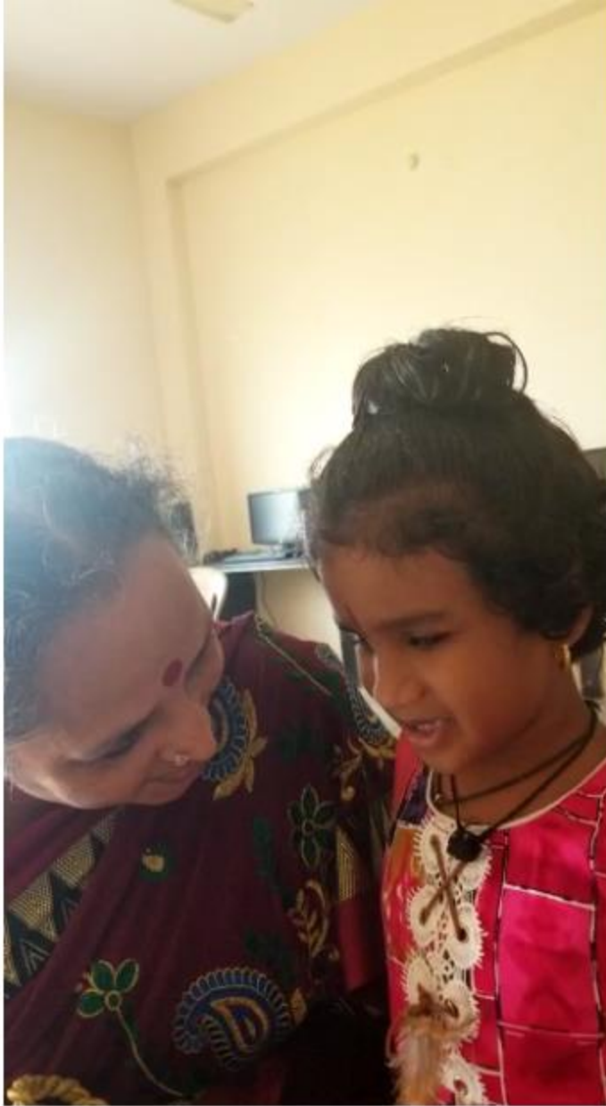
- Students interacting with the principal before heading home with their parents for Dussehra vacation