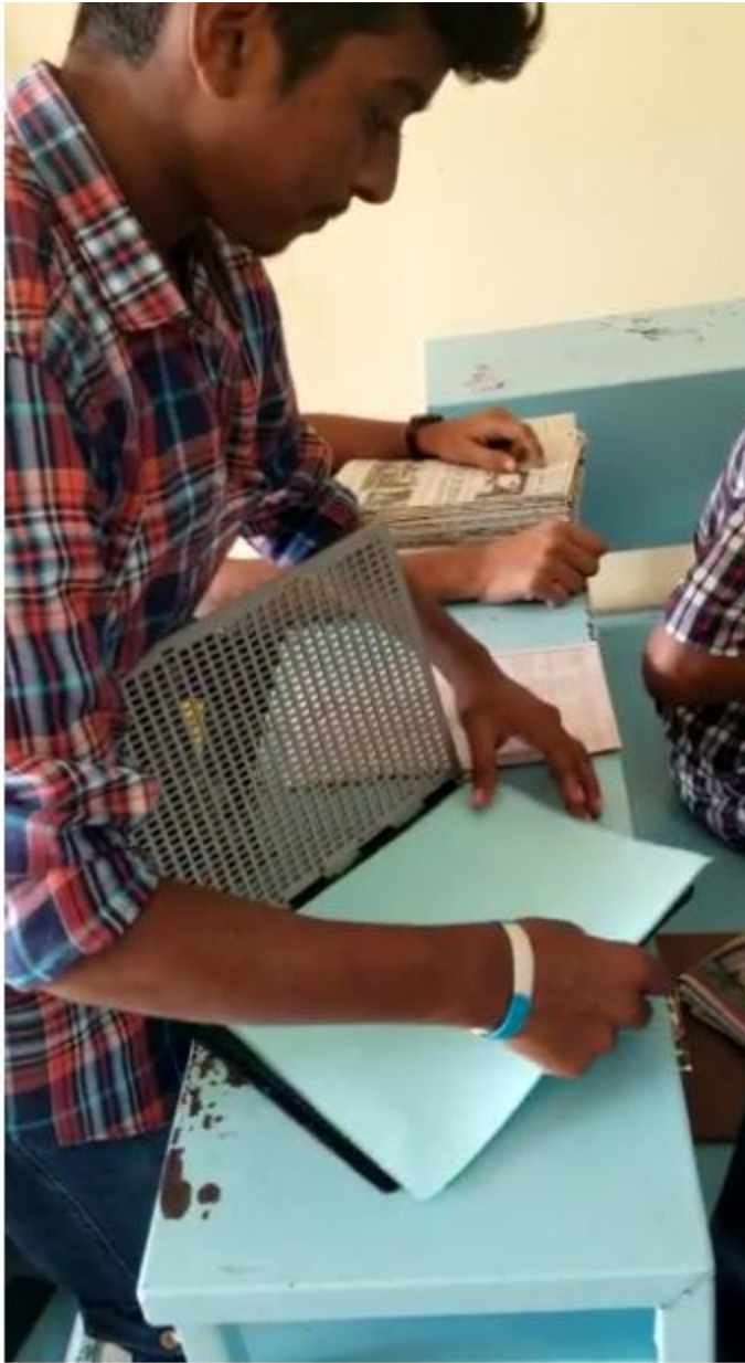
- insert papers in the Braille writer