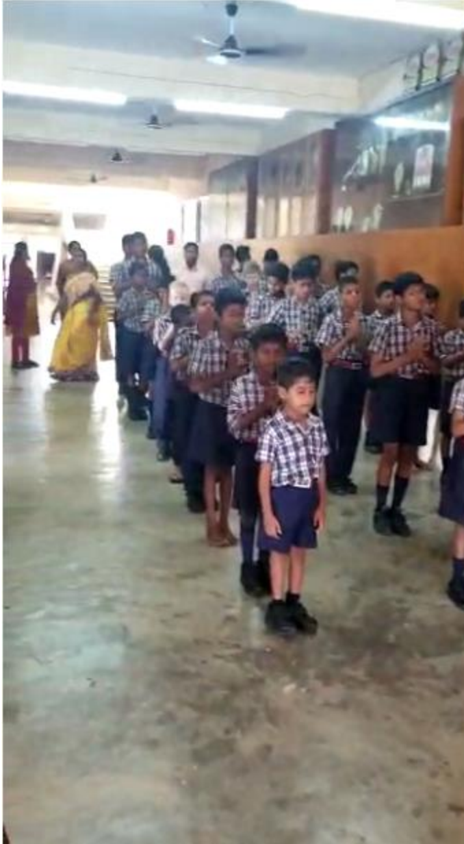
- children during assembly