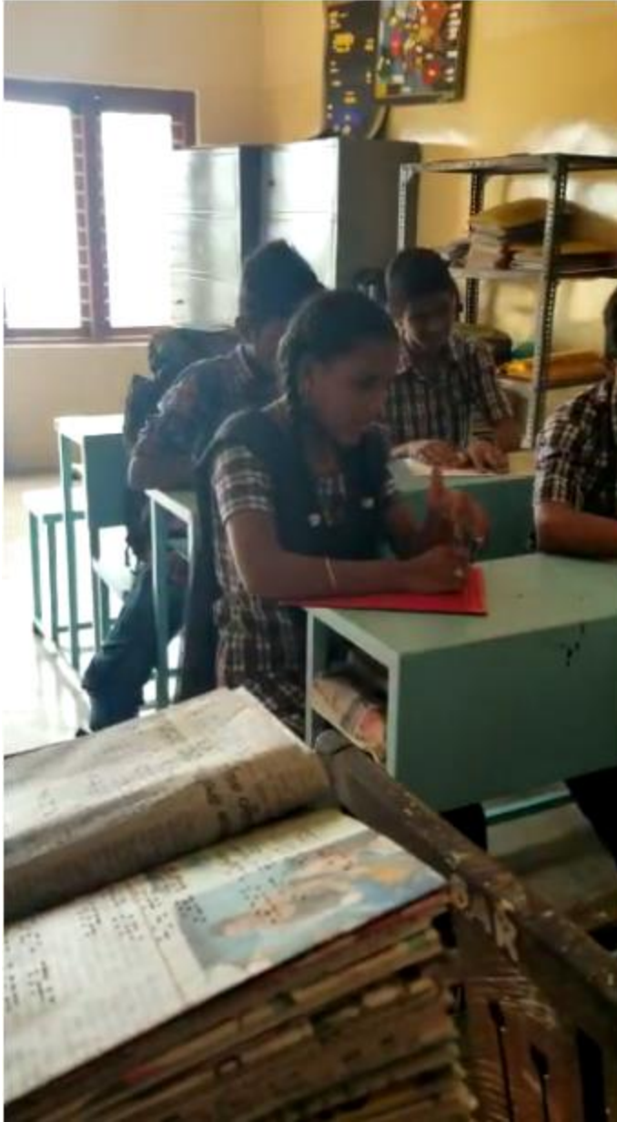
- teacher showing me how the kids take notes in Braille in a book made of newspaper.