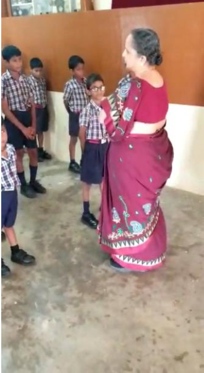
- principal talking to the children about the dos and don'ts during vacation

After the principal's instructions the children were dismissed and all of them went to their respective classes while the teachers signed in and then went to the classes: