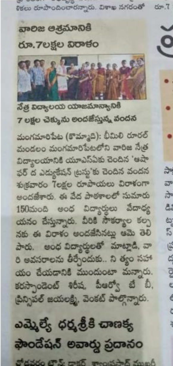
- The articles were published in Eenu local