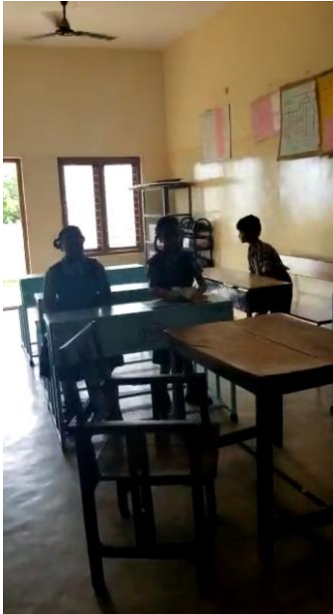
- students waiting for their teacher