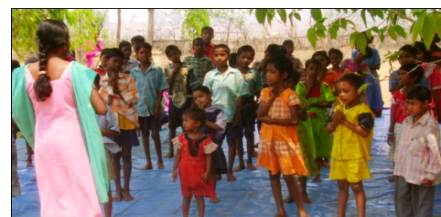
Anandalaya at Amlipani

The purpose driven Odisha Seva Prakalpa has delivered the output and the resulting outcome in terms of increased productivity, improvement in health care, family stabilization, and general betterment of social life of the socially disadvantaged groups. The special programmes and training for the village youths of all communities helped in creation of capability and confidence to organize, monitor and implement various village developmental programmes.