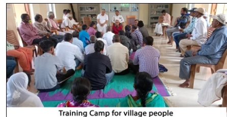
Training Camp for village people