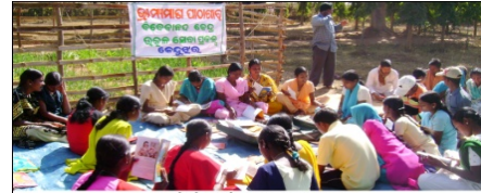
Mobile Library Program