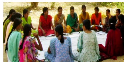
Monthly Meeting (Karyakarta working on women sector)