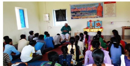
Anandalaya Acharya Training

The concept 'Anandalaya' was developed to start imparting learning on Shiksha, Samskara, Swasthya, and Swabhiman to children with a twin objective – onboarding every child for primary education and to ensure no dropouts before the standard V class. The Karyakartas were trained in the last quarter of 2006 to promote and manage Anandalaya. The decision on the choice of the location for piloting the project was based on the criteria 'village with a maximum drop-out rate' and it led to starting of the project on Jan 12 th , 2007 in the village Adakata, Ghatagaon Block, Kendujhar District. The following is a summary of achievements over last 16 years.