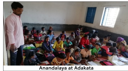
Anandalaya at Adakata