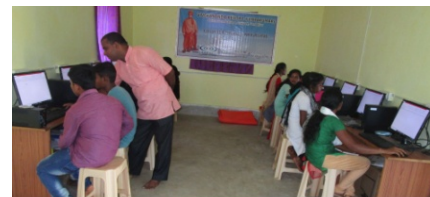
Computer Literacy program