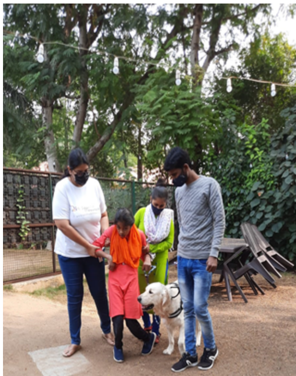
Animal assisted therapy