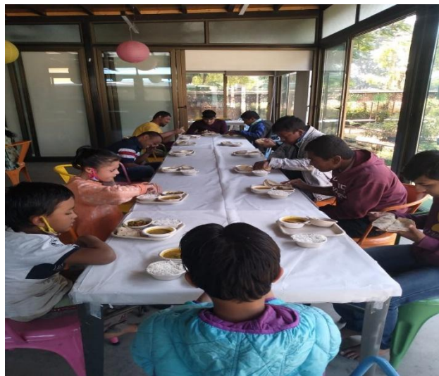
STK children eating together at Qi

Initially we started with the 3 dogs (Golden Retrievers named – Malai, Maska and Kulfi ) coming to the centre. The space was too small – but the 4 parents who had agreed and trusted our judgement to work with their children were also present during the therapy. Along with them were other parents – curious community members for whom the whole concept seemed extremely alien. But little by little – the dogs won each one of them and currently we have listed another 28 children – whose parents want to start animal assisted therapy for their children.