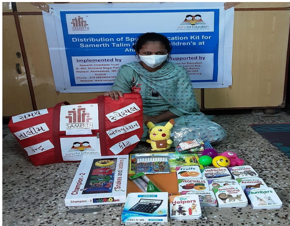
Individual kits given to all children based on their needs

Baal Dan (US) and GCSRA (Gujarat Corporate Social Responsibility Authority) a Gujarat government body will be supporting in providing nutritious snack and vocational centre at the Samerth Talim Kendra respectively till March 2022. We hope they will continue their support after this