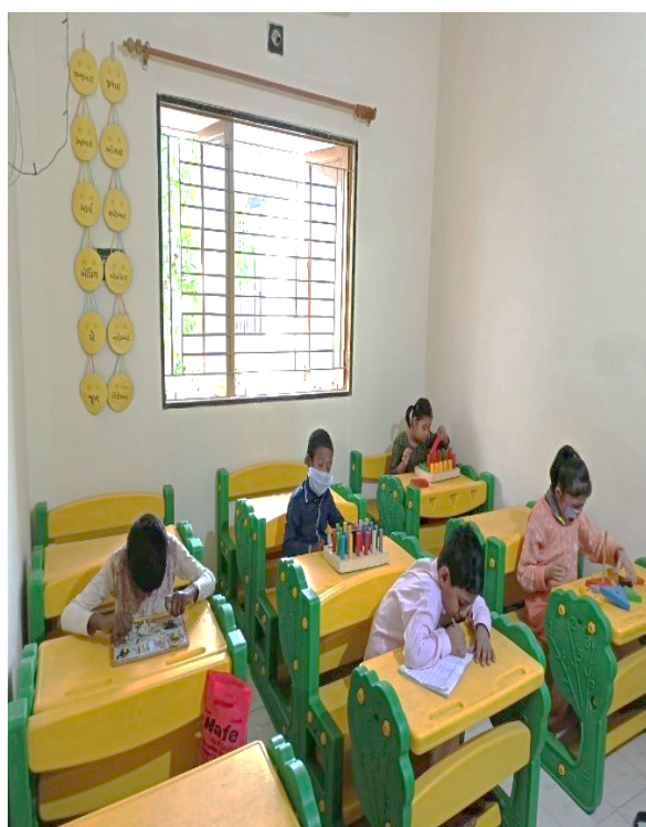
Early intervention class

A. Background: Samerth Talim Kendra was established in the year 2007 with 3 children, in the western slums of Ahmedabad. Today, it has grown to actively work with 98 children on a regular basis and has reached out to more than 400 children over the years. These are children and adults facing intellectual disability of more than 50% ranging from Down's Syndrome, Mental retardation, Autism, Cerebral Palsy etc.