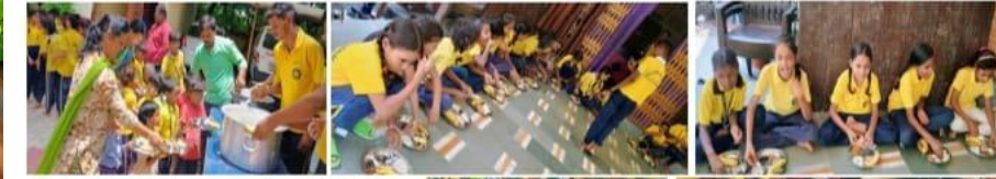
इस दृष्टिकोण के बीच सार्वजनिक विकास

चाराणसरी-प्रधानमंत्री आदर्श ग्राम नागपुर में आशा ट्रस्ट व लोक समिति द्वारा संचालित आशा सामाजिक विद्यालय में जोमैटो फीडिंग इंडिया के सहयोग से स्कूल में पढ़ने वाले बच्चों को मिड-डे मील योजना शुरू किया गया। सोमवार को योजना की शुरुआत की गई। योजना के तहत बच्चों को गरमागरम पका हुआ भोजन उपलब्ध कराया गया। पहले दिन बच्चों को खीर पूड़ी और केला दिया गया। ताजा गरम खाना पाकर बच्चों के चेहरे खिल उठे। इस