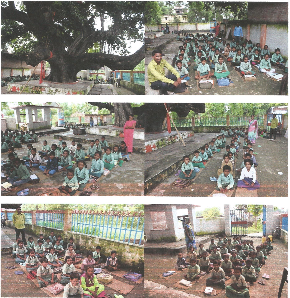
Harsos School and its students