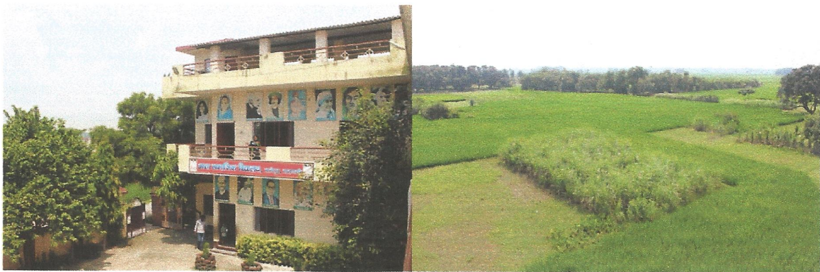
School and surrounding farmlands

The school building looks very good with two stories and 2 nd floor have a shaded area where trainings can be done. Some rooms are very big to accommodate special activities for students. The teachers showed me the I-cards that are being issued to students. Also now private books are introduced to overcome the issues of procurement of Government books.