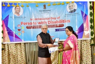
Best NGO in the State Government of Telangana in December 2024