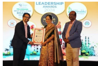
Telangana Best NGO CSR Leadership Award 2024