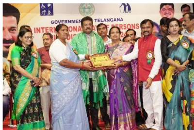
Best NGO in the State Government of Telangana in December 2024