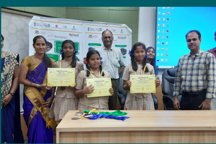
Winning 3rd place at RTC Impressions, 2023