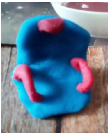
Workshop: Clay modelling