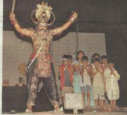
WHAT'S THE PUNISHMENT? Time to pay for sins.