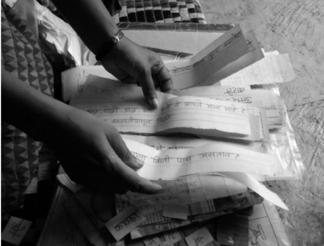
(A question and answer activity created by the