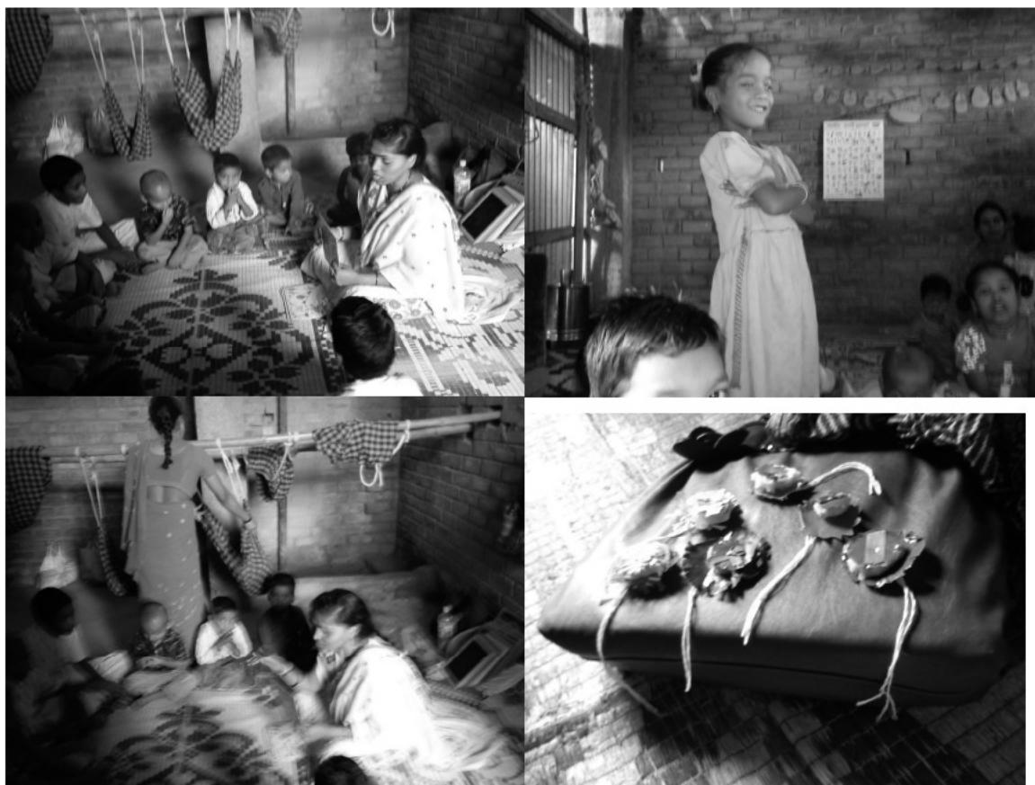
Rakhis made by the kids on the occasion of Raksha Bandhan.

A comprehensive documentation on attendance, dropouts owing to parents who have shifted to another construction site as well as documentation to track the progress of each child maintained by the teachers was impressive. Each class had an average strength of about 8-10 students in the study class, 16-17 students in Balwadi, and 5-6 students in EAC/ NFE classes.