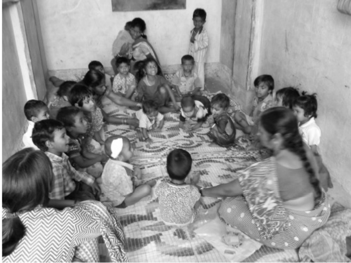
This is the room provided by the site owners where the teacher was narrating a story to the children with the help of picture cards. This room is reserved for the Balwadi and Crèche.