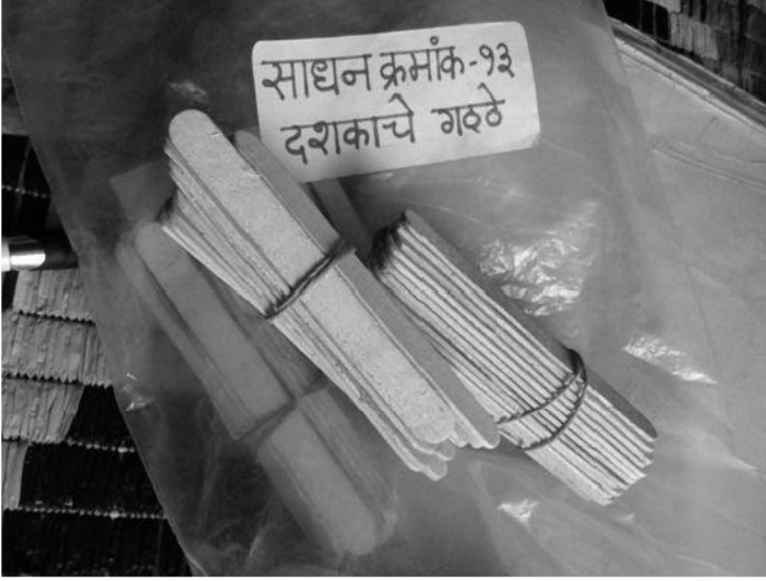
(For cutting skills)