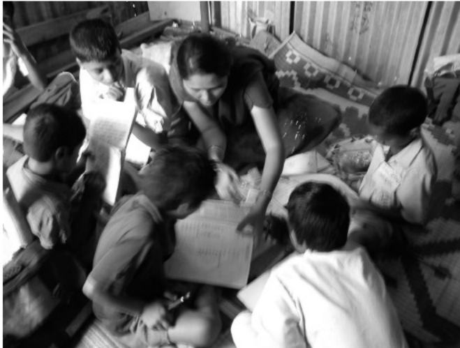
This is a borrowed room which is occupied by one of the workers. The children have to sit amidst the belongings of the family which puts up in this room.

After this we visited the school at Kumar Surabhi Construction site in Swargate. The students here were enjoying the stories narrated by the teacher with the help of Picture cards. Followed by this, all the students sang songs individually or narrated poems and then eventually it was lunch time. After saying their prayers they were picked up by the parents for lunch.