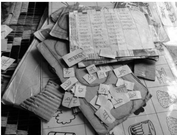
(For the alphabet)

All these Construction sites are about 2-4 Kms away from the Sant Ghadge School. This is where most of the students from the study class go to school. The students in EFA or the previously called Non Formal Education Classes are taught the Mulakshar , barakhadi, (the alphabet) and jodakshar (Words formed out of alphabet) depending on their proficiency. (viz. can recognize the alphabet, but cannot join alphabets to form words). Apart from the study material provided by DSS like books specially designed for various proficiency levels of Marathi, a lot of other teaching aids are used by the teachers, some created by themselves. Some photos of some of the interesting teaching aids like charts, puzzles,