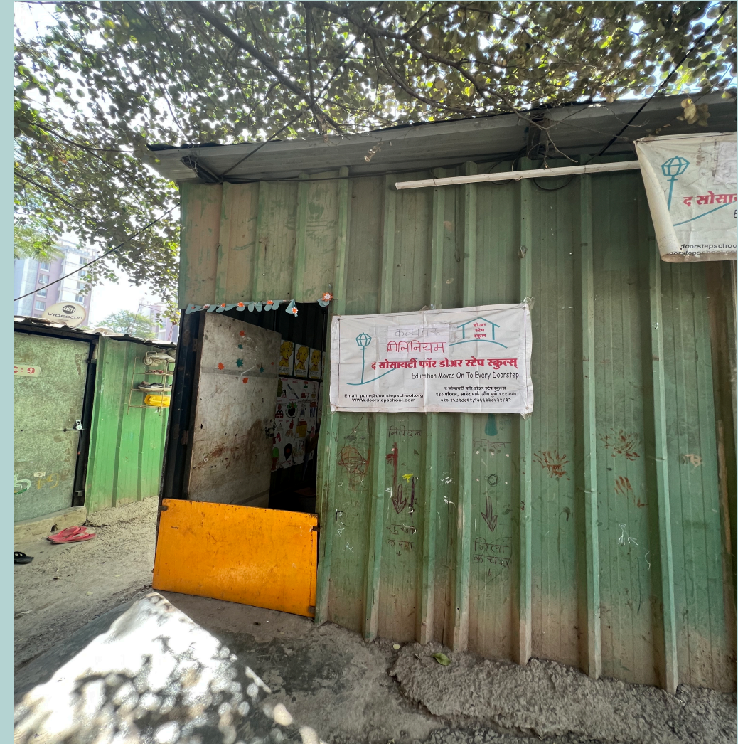
DSS site: Kalpataru Jade, Baner, Pune

To interact with the project staff, supervisors, teachers, and children to help understand their experiences