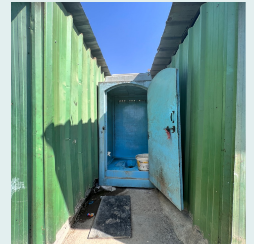
Bathrooms, living area, taps with running water