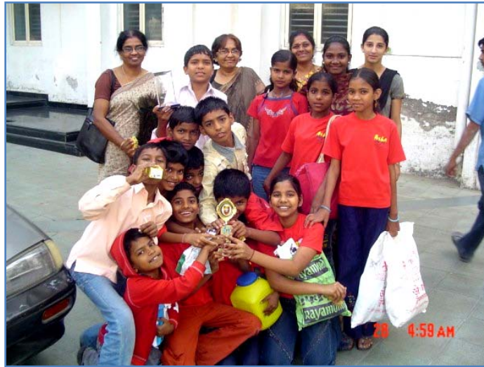
Asha Children after winning the Prize in Drama Competition at NMIMS