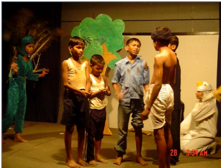
Children acting in Drama Competition at NMIMS