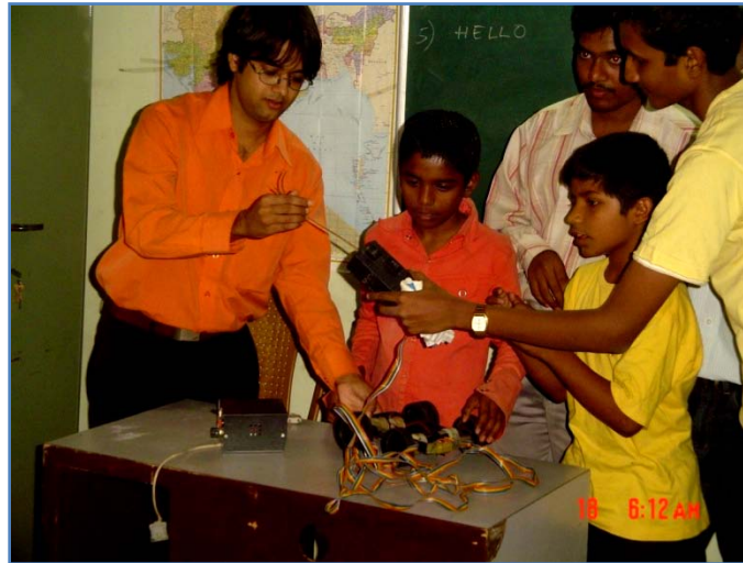
Let us learn Car Making! (Science Camp 2009)